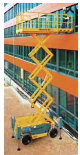
The C10DX is now available in North American as the Compact 2268RT.

With platform heights of 26 and 33ft, the 68 inch wide units offer a 450kg and 565kg platform capacity respectively. The automatic hydraulic differential lock helps the machines cope with uneven ground, while the newly designed auto-levelling jacks option provide fast set up and ensures that all four legs are in contact with the ground. The models will initially be manufactured in Europe and shipped to North America.