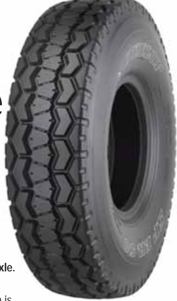
The Dunlop ER50 All Terrain crane tyre

The tread on the new tyre retains the continuous zigzag central zone, which is said to improve the footprint, prevent vibration and result in better ride comfort.