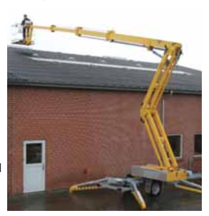
Omme Lift's new 2300 EX was unveiled at this year's Platformers' Days.

The dual riser lift offers an outreach of up to 12.7 metres with an approximate up and over height of six metres. Weighing 3,150kg it is 7.32 metres long and 1.7 metres wide and powered by a 200Ah battery pack. It can also be used in conjunction with a petrol or diesel engine or supplied as a 230V AC mains unit.