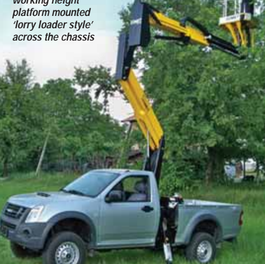
The X4 has a 12 metre working height platform mounted 'lorry loader style' across the chassis

Because of its size and weight it can be used in shopping precincts and on paved areas, and can be driven in multi-storey car parks without a headroom problem."