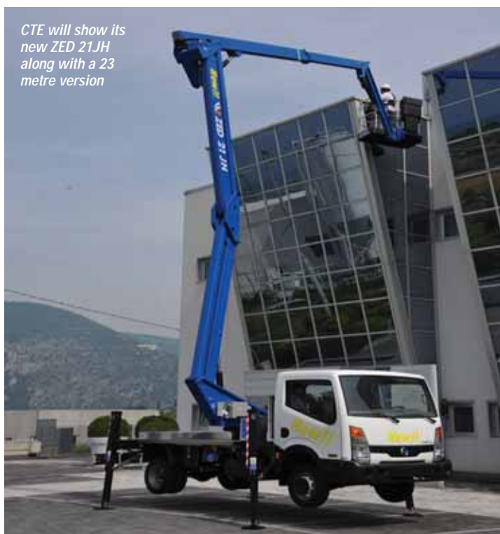
CTE will show its new ZED 21JH along with a 23 metre version

On the spider lift front, market leader Hinowa is celebrating its 25th anniversary and will show its first new Performance IIS product range in the form of the 17 metre Lightlift 17.75 IIS with seven metres of outreach, eight metres of up and over reach and an unrestricted platform capacity of 230kg. Imer will have its new spider lift range on show, which for many visitors will be the first opportunity to see them. Bluellift has also been working on a number of new products and may have some surprises up its sleeve, while Multitel is looking to expand its coverage of the spider lift market and always has plenty to show, as does Platform Basket and Palazzani and SUP Elefant may have a new lightweight 19 metre on show.