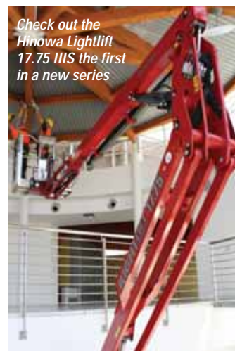
Check out the Hinowa Lightlift 17.75 IIS the first in a new series