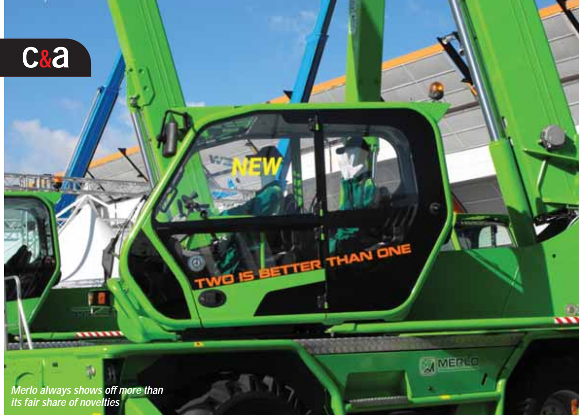
Merlo always shows off more than its fair share of novelties

Palfinger will surely have its five new models on show (look out for a new truck mounted platform as well) – see news page 8 – but the key stands are the local producers including PM, Cormagh - which every year shows off a bigger model - and Effer which is likely to highlight both its sector topping monsters alongside some of the smallest models available. Talking small, Next Hydraulics and its Maxi Crane range is always worth a look. It is not one of the big stands in the middle, but then again it doesn't need to be.