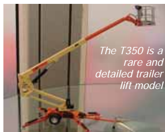
The T350 is a rare and detailed trailer lift model

of course been done before, although not in this scale. The other three new models can claim to be firsts, at least in the volume scale model market.