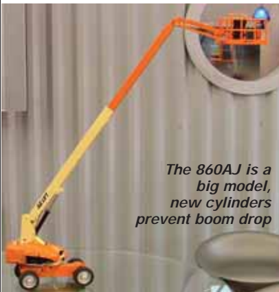
The 860AJ is a big model, new cylinders prevent boom drop

A rush of new models from JLG and a model with patents has spurred us into doing a page on scale models. We hope to make this a regular feature, repeating it whenever we receive sufficient input to justify it. So if you have built a model or are launching one, please do let us know.