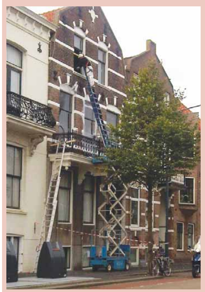
A man in Vlissingen, the Netherlands combines his ladder with a 20ft narrow aisle scissor to reach a window. When the photographer explained the risks of overturning the scissor by his make do methods he responded that he was being very careful!