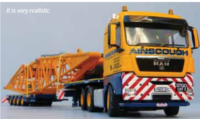
It is very realistic