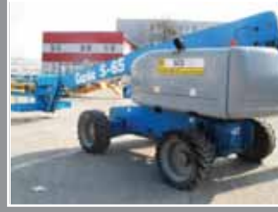
Genie S-65 Stick boom 21.80m - 2005/6/7/8