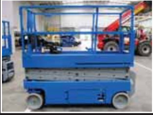
Genie GS-2032 Battery scissor lift 8.10m/363kg - 2005/6