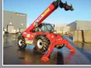
Manitou MT 1840 Telescopic forklift 18m/4 Tonne - 2008