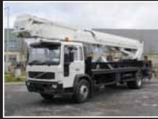
SIMON SS263 Truck mounted 27.8m - 2002