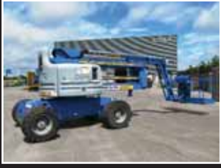
Genie Z-60/34 Articulated boom 20.40m - 2003/4/6/7