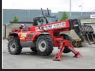
Manitou MT 1435 Telescopic forklift 13.6m/3.5 Tonne - 2006/7