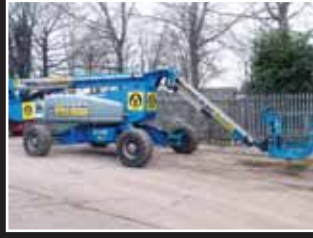
Genie Z-135/70 Articulated boom 43m - 2007/8/9