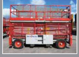
Skyjack SJ-9250 Diesel scissor lift 17.24m/909kg - 2007