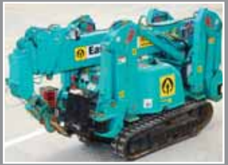
MAEDA MC 285 CRM Mini crane 8.70m/ 2.8 Tonne - 2006