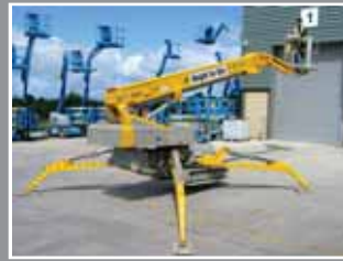
OMME 3000RBD Specialised boom 30m - 2006/7/8