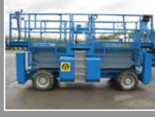
Genie GS-3384 RT Diesel scissor lift 12.06m/1134kg 2005/6/7/8