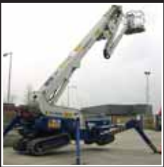
Spider FS 420 C Specialised Boom 42m - 2008