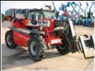
Manitou MLT 523T Telescopic forklift 5m/2.3 Tonne - 2006/7/8