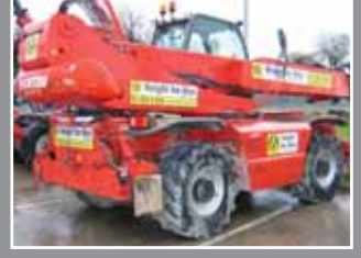
Manitou MRT 2540 Telescopic forklift 24.60m/4 Tonne - 2006/7/8