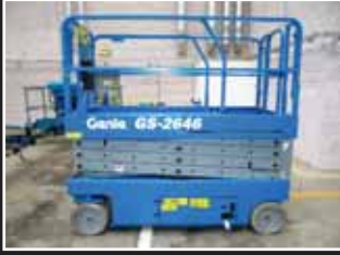
Genie GS-2646 Battery scissor lift 9.92m/454kg - 2005/6/7/8