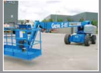
Genie S-85 Stick boom 27.9m - 2005/6/7/8