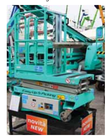
Imer's new stock picking version of the five metre self propelled Easy Up 5 SP.

The Imer group launched a new stock picking version of its five metre, self-propelled Easy Up 5 SP. The Picking version features a manually adjusted, seven position tray capable of carrying 80kg. At its highest position it is 864mm above the platform. The one person platform measures 700 x 620mm with a maximum capacity of 120kg. Overall it is slightly heavier than