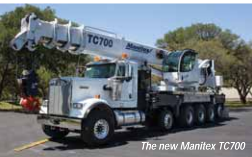
The new Manitex TC700

US boom truck specialist Manitex has launched its largest crane to date the 70 ton/63tonne TC700. While the new crane has boom truck heritage it is very much a commercial carrier mounted truck crane with a 38.1 metre four section main boom and a 54.9 metre maximum tip height when fitted with a two part extension.