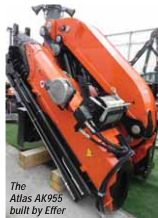
The Atlas AK955 built by Effer

Effer branded cranes will also be sold and supported by Atlas dealers in a number of countries with particular emphasis on Germany and the Middle East, where Atlas has a strong network. The Effer cranes will be sold by Atlas in Germany and other markets in Atlas orange and branding, while the Effer brand and yellow colour will be used in the UK. At Bauma Atlas unveiled the new Atlas AK 955, built by Effer.