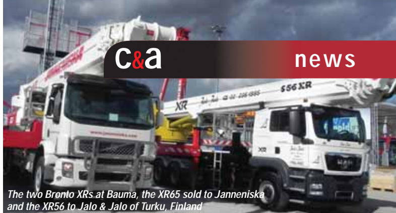
The two Bronto XRs at Bauma, the XR65 sold to Janneniska and the XR56 to Jalo & Jalo of Turku, Finland

The TC700 has been designed as a 'global' machine and is CE compliant, designed to be fitted to a wide variety of trucks. Overseas it will be fitted to a four axle chassis, while five and six axle factory installed configurations will be available for North America.