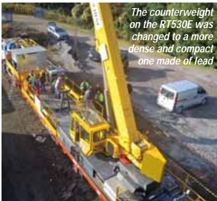
The counterweight on the RT530E was changed to a more dense and compact one made of lead

BLE opted for a 30 tonne Grove RT530E-2 superstructure with a 29 metre main boom, reducing its maximum capacity to 14.3 tonnes at a three metre radius and 1.2 tonnes at 12 metres. It then removed the standard steel counterweight replacing it with an unusual shaped lead one that was significantly more compact. Once mounted on an 18.66