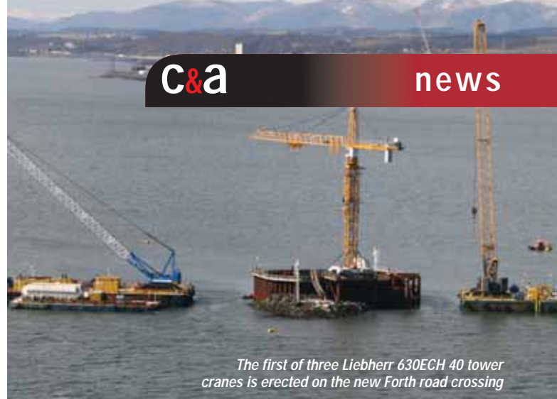
The first of three Liebherr 630ECH 40 tower cranes is erected on the new Forth road crossing