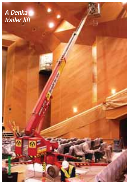
A Denka trailer lift