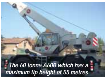
The 60 tonne A600 which has a maximum tip height of 55 metres

The cranes will be used to support its activities in the Middle East and Africa. ALE's regional director of Middle East and Africa Richard Peckover said: "Following operator training, all the cranes are meeting our expectations and performing satisfactorily on a day-to-day basis."