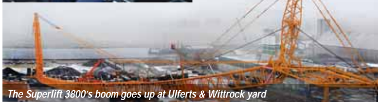
The Superlift 3800's boom goes up at Ulferts & Wittrock yard