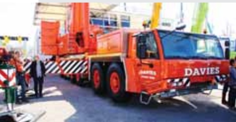
Davies new Tadano Faun ATF 400G-6 was the star of the Bauma stand.

opened Cardiff depot, in order to offer coverage over a wider area and to help reinforce the company's presence in South Wales.