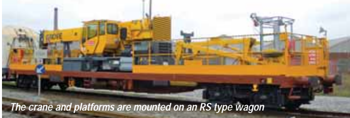
The crane and platforms are mounted on an RS type wagon