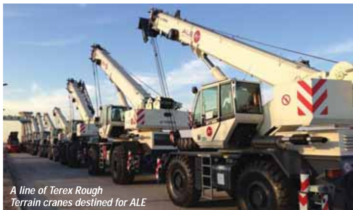
A line of Terex Rough Terrain cranes destined for ALE