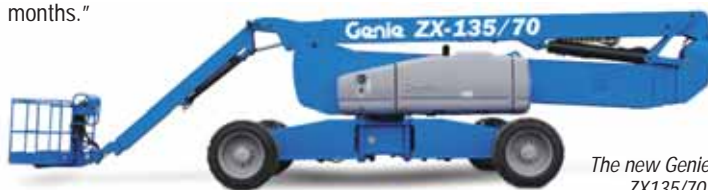
The new Genie ZX135/70.