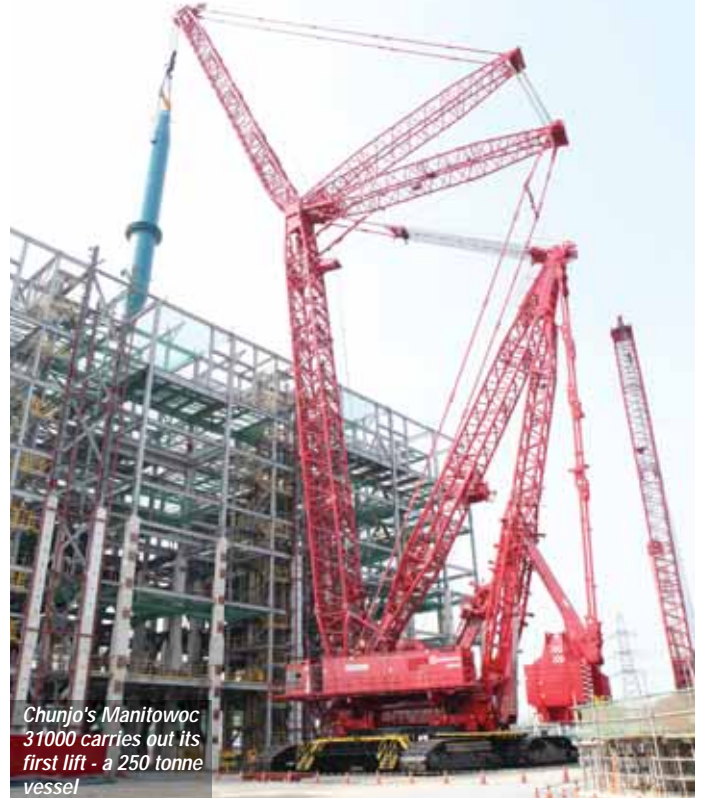
Chunjo's Manitowoc 31000 carries out its first lift - a 250 tonne vessel