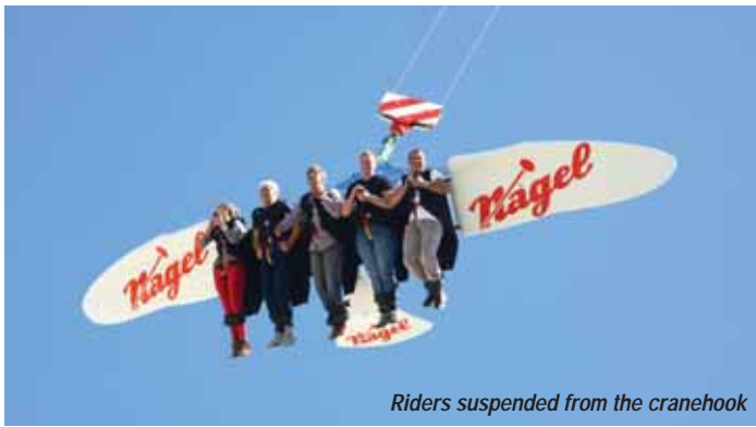
Riders suspended from the cranehook