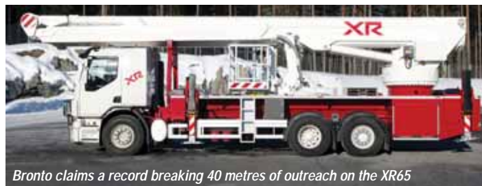
Bronto claims a record breaking 40 metres of outreach on the XR65

Bronto said it has focussed on lower running costs, and a greater working envelope per tonne of Gross Vehicle Weight. The new models have up to 15 percent more outreach and a 35 percent better working envelope. The two new units have an overall length of less than 12 metres, low axle weights, rear wheel steer, all-wheel drive with Hydro-Drive, 180 degrees platform rotation, Bronto B+ Geometric Control System, longer outrigger jacks for levelling on slopes up to 10 degrees, faster auto levelling, fully variable jacking widths, a 2,000kg lifting eye on the main boom and a 300kg platform winch or 1,300kg boom winch.