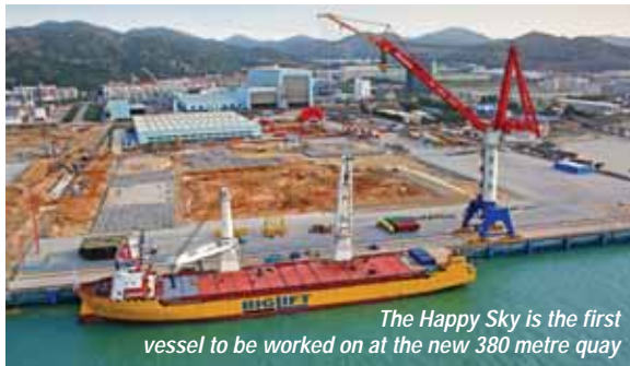
The Happy Sky is the first vessel to be worked on at the new 380 metre quay

The crane, designed and fabricated by Huisman, has two main lifting configurations - Heavy lift, capable of lifting 2,400 tonnes at 30 metres radius with a hook height of 100 metres, and Extended reach, which can lift 200 tonnes at 90 metres and a height of 140 metres. The crane can also travel with these loads along the full length of the quay. The new quayside was opened during the naming ceremony of BigLift's new Heavy Lift Vessel 'Happy Sky' which features two 900 tonne Huisman Mast Cranes.