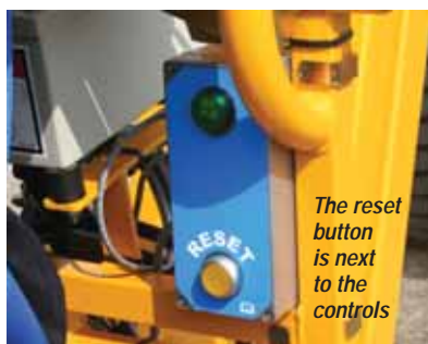
The reset button is next to the controls