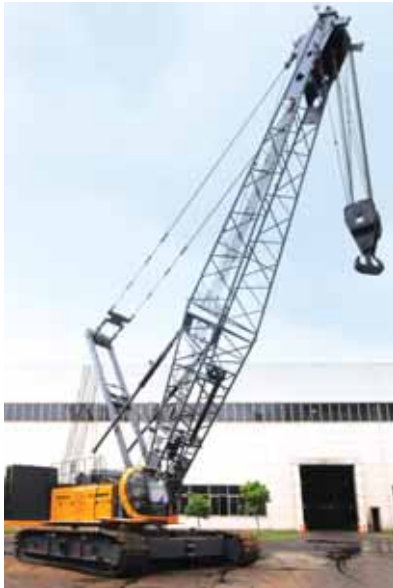
Sany America has added a new crawler crane to its line-up with the 165 ton (150 tonne) SCC8150.

The SRC885 has a five section 45 metre full power boom, with a 9.2 to 16 metres two part boom extension. Overall weight is 52,562kg and it uses globally sourced key components including a Cummins engine, Braden hoists, a Dana transmission and Parker hydraulics.