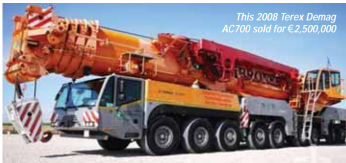
This 2008 Terex Demag AC700 sold for €2,500,000