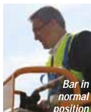
Bar in normal position