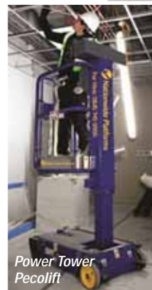
Power Tower Pecalift

Nationwide Platforms is adding more than 1,650 new access units at a cost of £20 million to its fleet this year