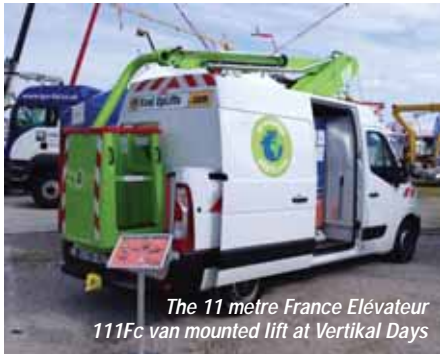
The 11 metre France Elévateur 111Fc van mounted lift at Vertikal Days

The compact unit offers up to 6.5 metres of outreach with 120kg platform capacity and does not require stabilisers. The unit also has the capability to work on slopes and typically offers 600kg of payload in the van, depending on the vehicle's options and specification.