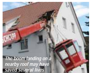
The boom landing on a nearby roof may have saved several lives