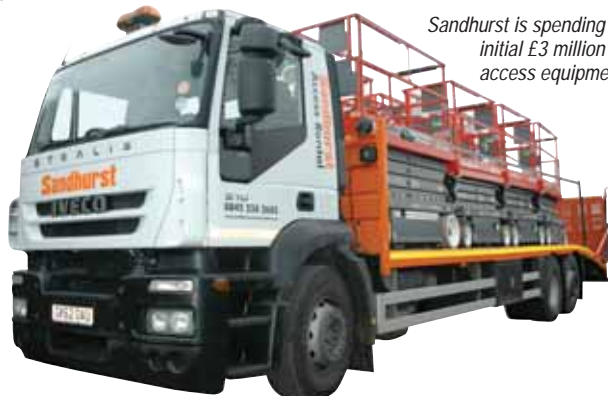
Sandhurst is spending an initial £3 million on access equipment.

Having set up its systems and initial inventory it has moved into a 5,600 square metre facility at the company's Rochester site, which includes a rental hub and training centre for the South East and London. In addition its depots in Bristol and Birmingham are being equipped as powered access locations to cover the South West and the Midlands. At a later date it intends to add powered access to its other depots in Manchester, Newcastle and Fife, Scotland.