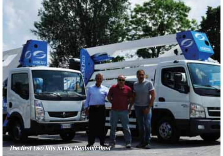
The first two lifts in the Rentalift fleet