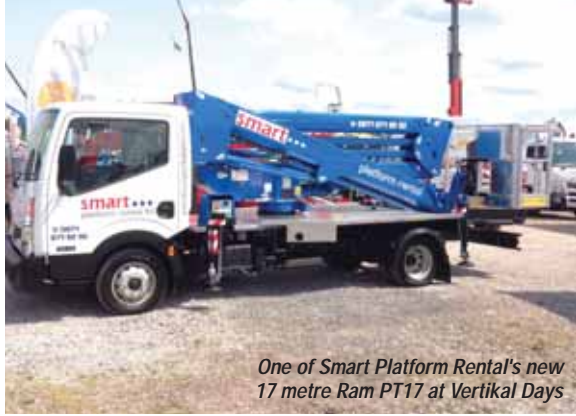
One of Smart Platform Rental's new 17 metre Ram PT17 at Vertikal Days