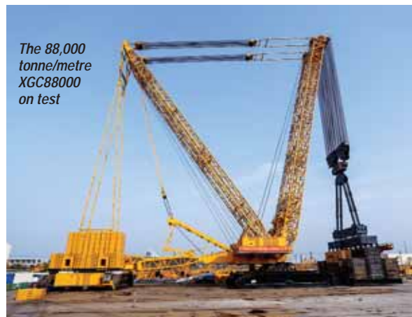
The 88,000 tonne/metre XGC88000 on test

The lift follows a full testing programme in which XCMG claimed a world record lift - a 4,500 tonne test load on a 60 metre boom at a radius of 17 metres.