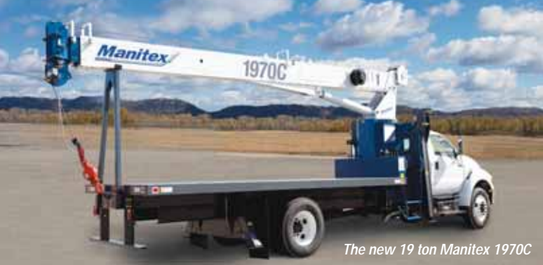
The new 19 ton Manitex 1970C