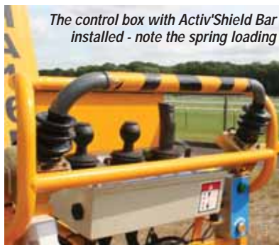
The control box with ActivShield Bar installed - note the spring loading

The unit is now available as an option on all Haulotte diesel booms and will be offered on electric booms later in the year. It can also be installed on all machines dating back to 2008, while older units can be retrofitted on a case by case basis.