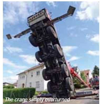
The crane simply overturned

Luckily the boom came down onto the roof of a house which supported its weight and the chain slings holding the cabin held firm so that it came to a stop in mid-air. The 13 were then rescued and taken to hospital although we understand that two of the adults were badly injured and had to be airlifted to hospital - the rest were treated locally. The crane appears to have been well set up and there were no apparent problems with the ground, leaving overloading/over-reaching as the likely cause of the incident. Police are investigating.