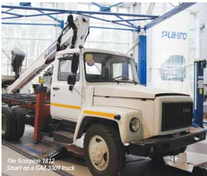
The Scorpion 1812 Smart on a GAZ 3309 truck

The first installations were supervised by a representative from Oil&Steel, who provided training and verified the local capability and expertise. Vertex agreed a partnership in principle with Oil&Steel to mount its aerial lifts on local vehicles back in 2012. Once complete both units were exhibited at the recent CTT 2013 - the Construction Equipment exhibition in Moscow.