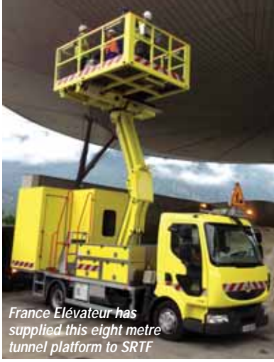
France Elévateur has supplied this eight metre tunnel platform to SRTF

France Elévateur has supplied a special tunnel maintenance lift for work in the Fréjus tunnel between France and Italy.