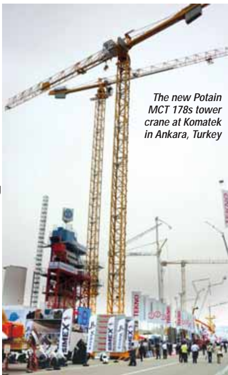
The new Potain MCT 178s tower crane at Komatek in Ankara, Turkey

Manitowoc is targeting Africa, Russia and surrounding CIS countries as key markets for the MCT 178.