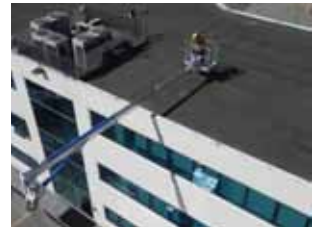
With mid rail mounting flat platform bottom the MX250 will appeal to roofers.

Access Industries the Multitel dealer for the UK unveiled the new 23.5 metre MX235 truck mounted lift at Vertikal Days. The new machine is based on the popular 25 metre MX250 but features an end/mid cage mounted platform, rather than the 250's pedestal mount. It also includes fully automatically variable outreach system with up to 11.5 metre of working outreach and a clear platform bottom making it ideal for roofing and tree work, among other applications.