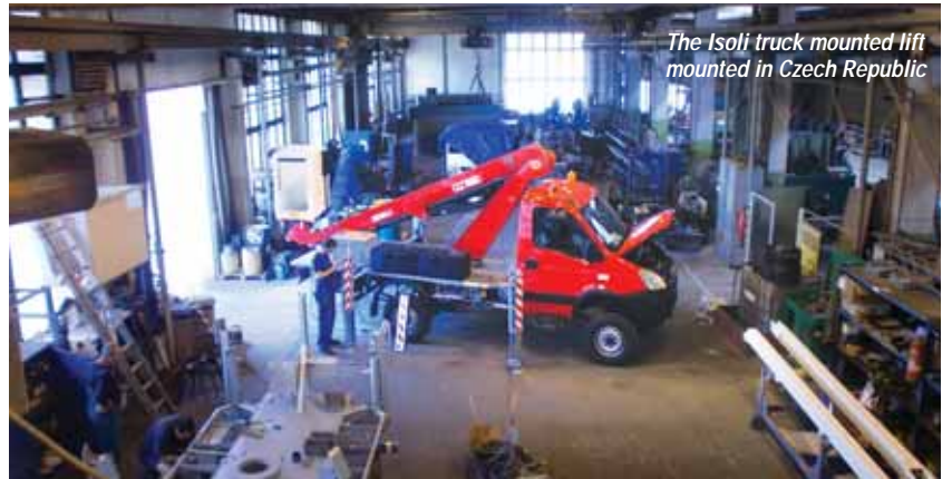
The Isoli truck mounted lift mounted in Czech Republic

Truck mounted lift manufacturer Isoli says that it has gained a significant share of the truck mounted lift market in the Czech Republic and has now started to mount units locally. The company moved its distribution to new company Inreka Plošiny Servis in Uherský Brod - south east of Brno last year. The first unit to come off line was a 16.4 metre straight telescopic Isoli PT 165, mounted on an Iveco Daily 4x4 chassis for Kilowatt Elektromontage. The unit which offers up to nine metres of outreach included a 1,000 volt insulated platform.