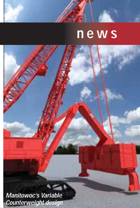
Manitowoc's Variable Counterweight design

Sany said that it will respond through appropriate legal measures to protect its own intellectual property. A statement issued by Sany Heavy Industry president Xiang Wenbo said: "Sany is proud of its industry-leading crane designs and the heavy equipment products and solutions we provide for our customers. We categorically reject the claims made by Manitowoc and stand fully behind our market-leading products."