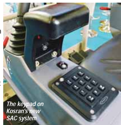
The keypad on Kosran's new SAC system

Nationwide Platforms has fitted 140 Kosran SAC systems - re-branded by Nationwide as SkySentry - to a fleet it supplied to Skanska for the Royal Hospital/St Bart's redevelopment in London, allowing it to accurately bill the contractor and 22 sub-contractors for the hours spent on each lift; and to keep a stock of spare machines on-site.