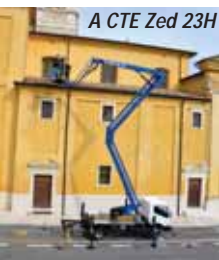
A CTE Zed 23H

It adds that it manufactured 440 aerial platforms during the first five months of the year achieving a 37 percent increase over last year, predicting that it will finish the year up 30 percent. The company said: "Our new products launched last year and earlier this year has helped the growth along with considerably higher foreign sales of B-Lift and ZED aerial platforms, especially in the Middle East."