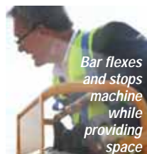
Bar flexes and stops machine while providing space