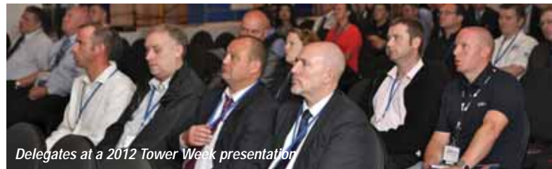
Delegates at a 2012 Tower Week presentation