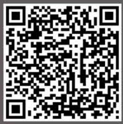
USE SMART PHONE Q R CODE READER

The HR17 Hybrid 4x4 is the ultimate combination of performance, economy, and most importantly safety.