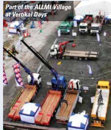
Part of the ALLMI Village at Vertikal Days

"We have participated in every Vertikal Days show since its inception in 2007, but are expecting 2014 to be the best so far, with the greatest array of equipment on display from manufacturers of both loader cranes and ancillary equipment. There will also be a wealth of guidance and advice available on the ALLMI stand and of course, once again, we will be running the ALLMI Operator of the Year Competition, for which we're already receiving a great deal of interest from potential participants."