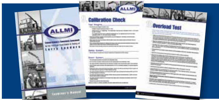
ALLMI is encouraging members to attend its abbreviated Thorough Examiner training course.