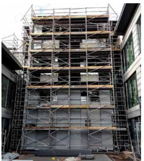
structure erected in Aberdeen

different configurations. The course reflects the growing use of mobile access towers in a wide range of different, and often demanding, applications.