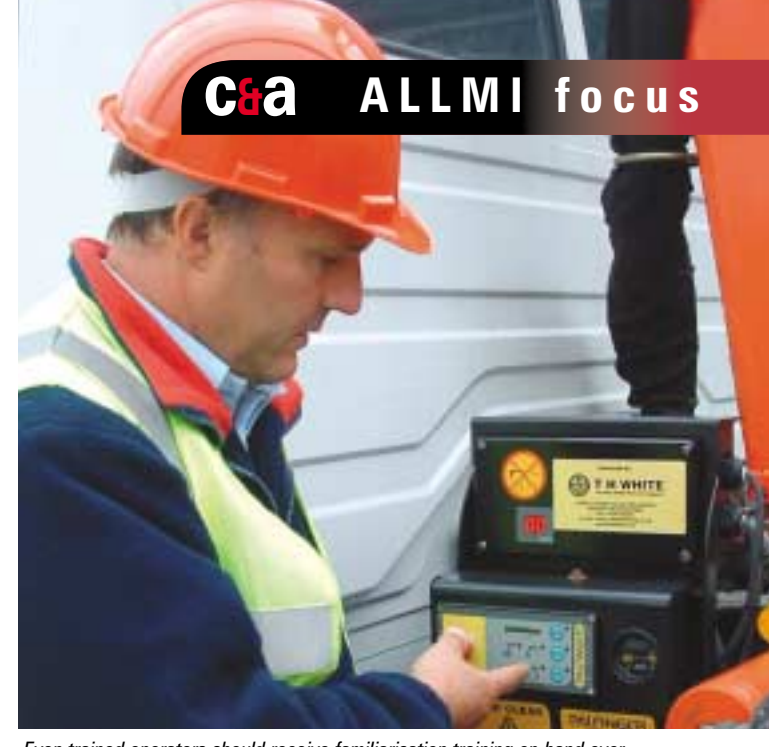
Even trained operators should receive familiarisation training on hand over.

Ask for details of the maintenance arrangements for the lorry loader, especially for longer-term hires. The Certificate of Thorough Examination will show when the next examination is due. If this falls within the hire period, confirm what the arrangements are for having the examination carried out and what the procedure is for dealing with any corrective action resulting from it. Also, establish the requirements of the daily and weekly maintenance tasks and ensure that these are carried out as per the manufacturer's instructions.