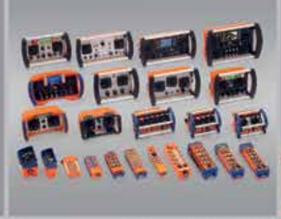
Operate your application perfectly with your personal choice from our wide product range.

Control industrial cranes and chain hoists easily and efficiently with the FSE 308 and FSE 312 plug & play receivers.