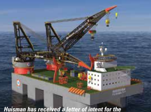
Huisman has received a letter of intent for the construction of two 10,000 tonne cranes