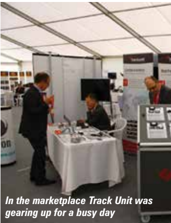
In the marketplace Track Unit was gearing up for a busy day