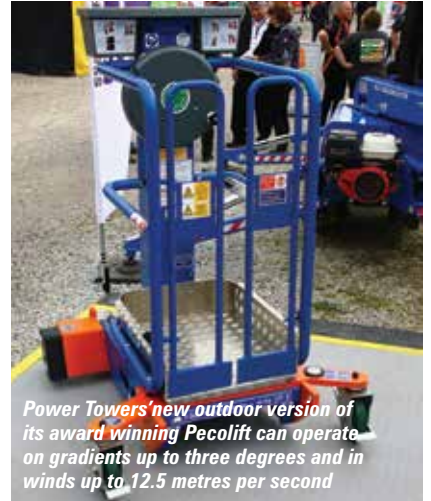
Power Towers' new outdoor version of its award winning Pecolift can operate on gradients up to three degrees and in winds up to 12.5 metres per second