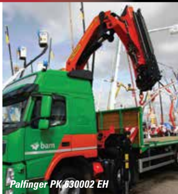
Palfinger PK 030002 EH