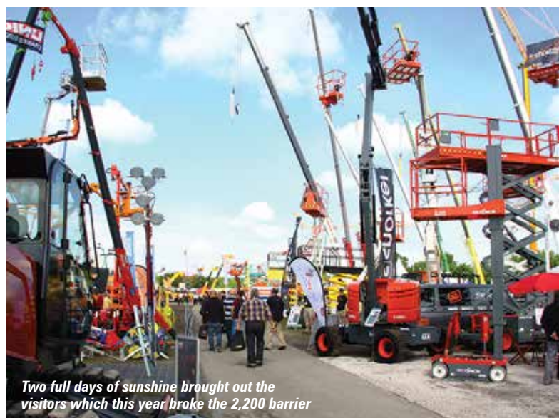
Two full days of sunshine brought out the visitors which this year broke the 2,200 barrier