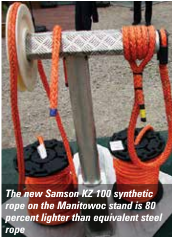
The new Samson KZ 100 synthetic rope on the Maniwoc stand is 80 percent lighter than equivalent steel rope