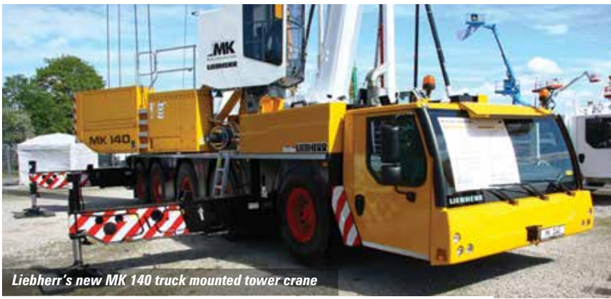
Liebherr's new MK 140 truck mounted tower crane