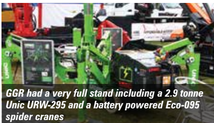
GGR had a very full stand including a 2.9 tonne Unic URW-295 and a battery powered Eco-095 spider cranes