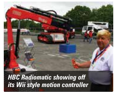
HBC Radiomatic showing off its Wii style motion controller