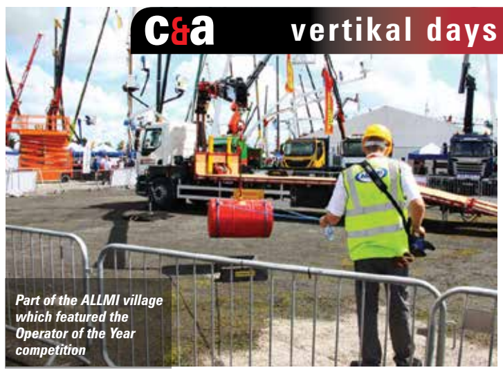
Part of the ALLMI village which featured the Operator of the Year competition