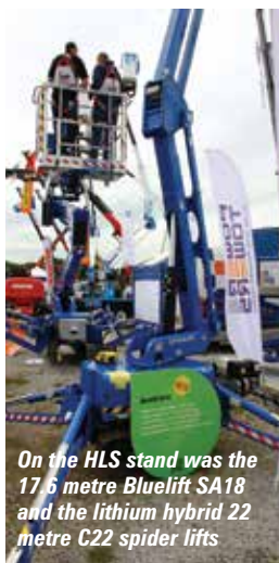
On the HLS stand was the 17.6 metre Bluelift SA18 and the lithium hybrid 22 metre C22 spider lifts