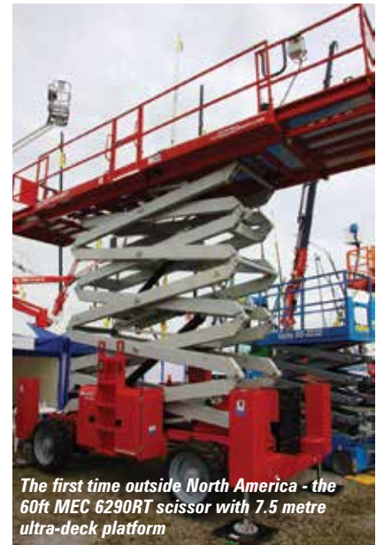
The first time outside North America - the 60ft MEC 6290RT scissor with 7.5 metre ultra-deck platform