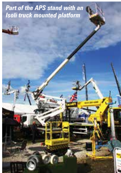
Part of the APS stand with an Isoli truck mounted platform