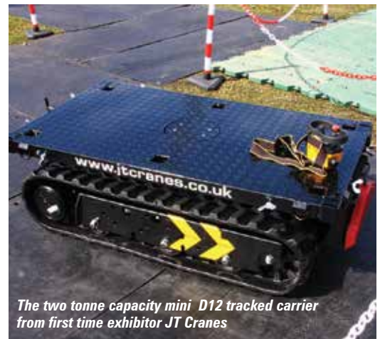
The two tonne capacity mini D12 tracked carrier from first time exhibitor JT Cranes