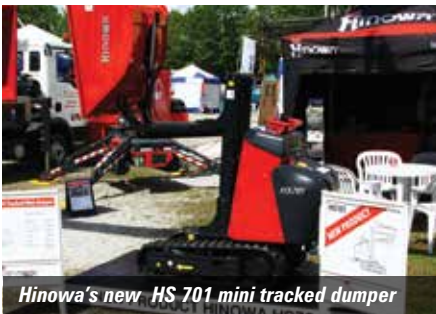
Hinowa's new HS 701 mini tracked dumper