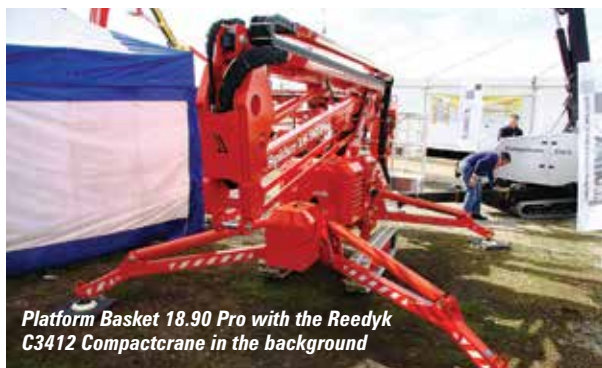
Platform Basket 18.90 Pro with the Reedyk C3412 Compactcrane in the background