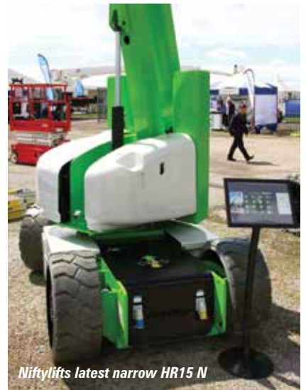
Niftylifts latest narrow HR15 N