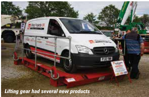
Lifting gear had several new products