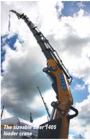
The sizeable Eifer 1405 loader crane