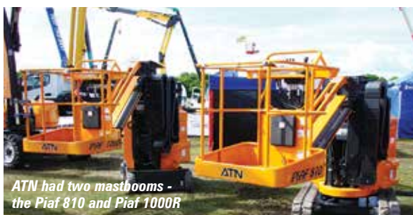
ATN had two mastbooms - the Piaf 810 and Piaf 1000R