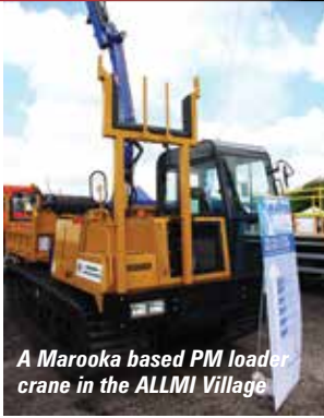
A Marooka based PM loader crane in the ALLMI Village