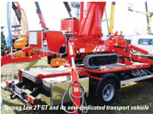
Teupen Leo 21 GT and its new dedicated transport vehicle