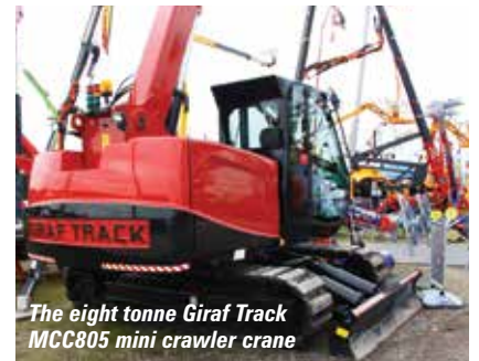
The eight tonne Giraf Track MCC805 mini crawler crane