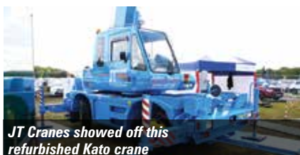
JT Cranes showed off this refurbished Kato crane