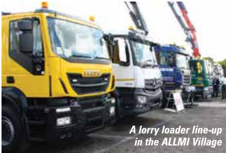
A lorry loader line-up in the ALLMI Village