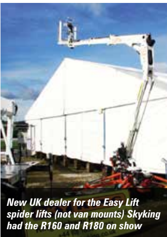
New UK dealer for the Easy Lift spider lifts (not van mounts) Skyking had the R160 and R180 on show