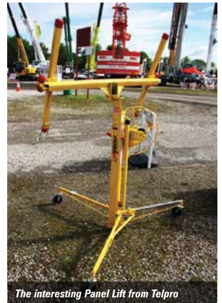
The interesting Panel Lift from Telpro