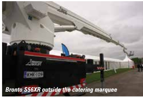
Bronto S56XR outside the catering marquee