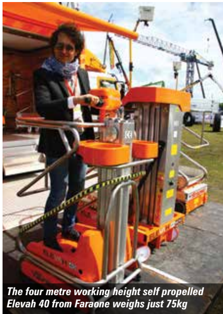
The four metre working height self propelled Elevah 40 from Faraone weighs just 75kg