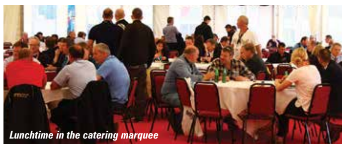
Lunchtime in the catering marquee