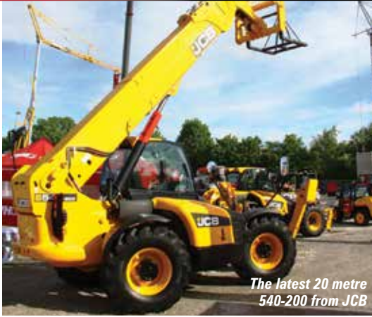
The latest 20 metre 540-200 from JCB