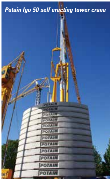
Potain Igo 50 self erecting tower crane