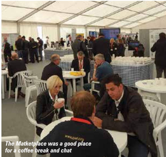
The Marketplace was a good place for a coffee break and chat