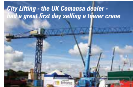
City Lifting - the UK Comansa dealer - had a great first day selling a tower crane