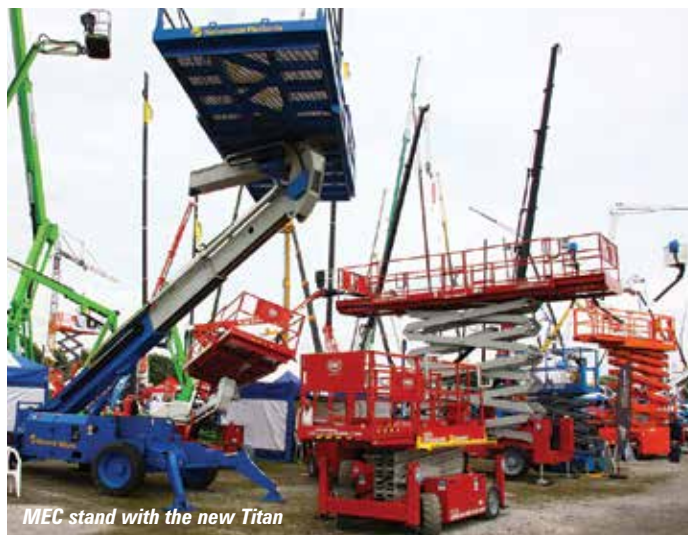
MEC stand with the new Titan