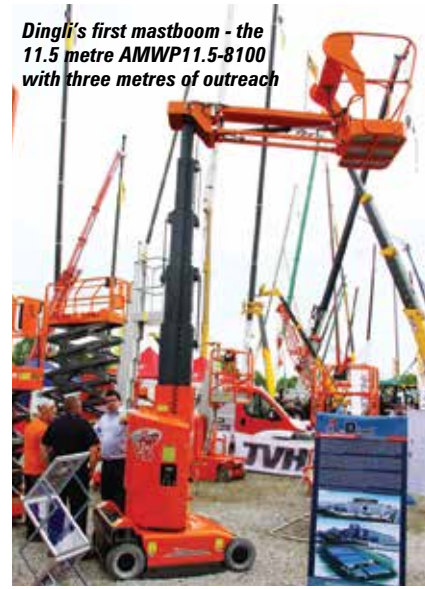
Dingli's first mastboom - the 11.5 metre AMWP11.5-8100 with three metres of outreach