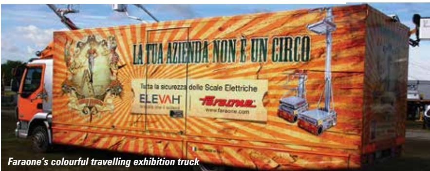
Faraone's colourful travelling exhibition truck