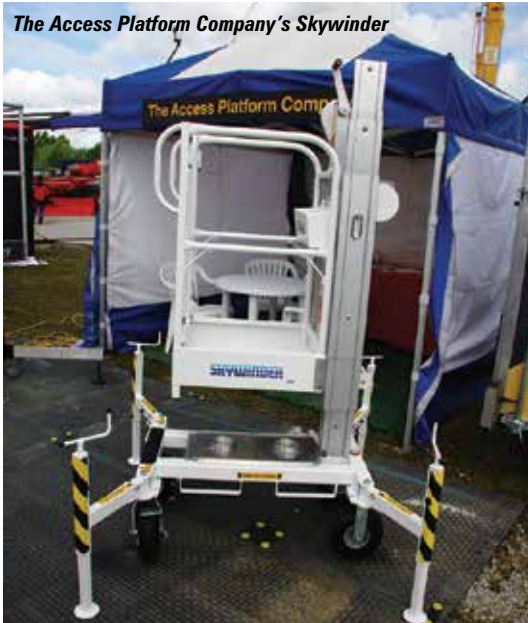
The Access Platform Company's Skywinder