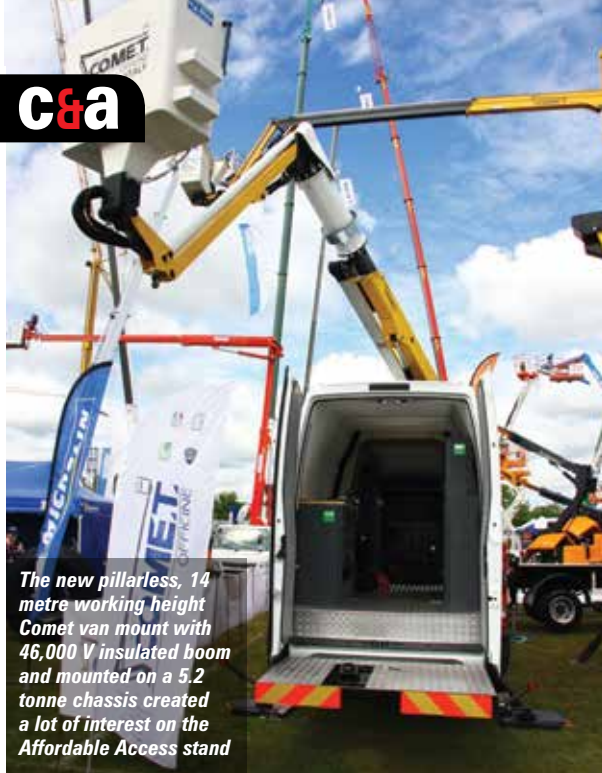
The new pillarless, 14 metre working height Comet van mount with 46,000 V insulated boom and mounted on a 5.2 tonne chassis created a lot of interest on the Affordable Access stand