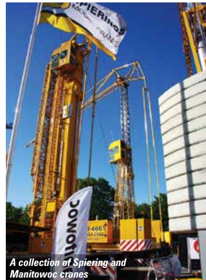
A collection of Spiering and Manitowoc cranes