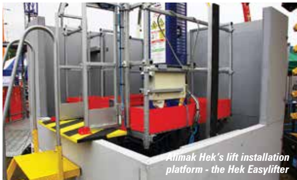
Animak Hek's lift installation platform - the Hek Easylifter