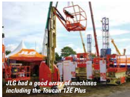
JLG had a good array of machines including the Toucan 12E Plus