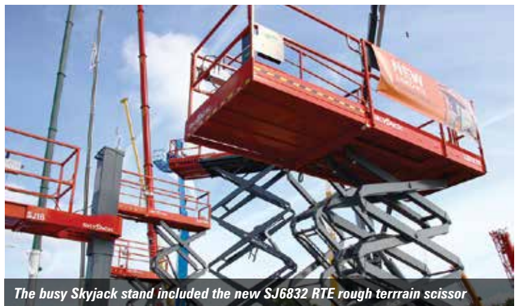
The busy Skyjack stand included the new SJ6832 RTE rough terrain scissor