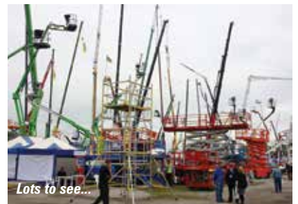
Lots to see...