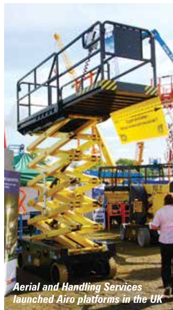
Aerial and Handling Services launched Airo platforms in the UK