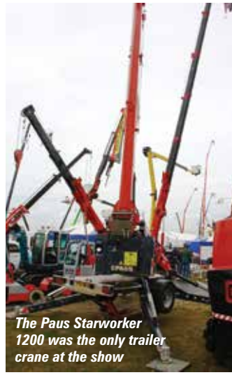
The Paus Starworker 1200 was the only trailer crane at the show