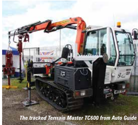
The tracked Terrain Master TC600 from Auto Guide