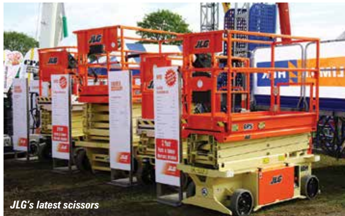
JLG's latest scissors