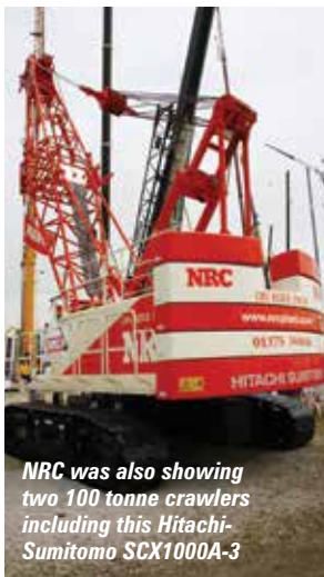
NRC was also showing two 100 tonne crawlers including this Hitachi-Sumitomo SCX1000A-3