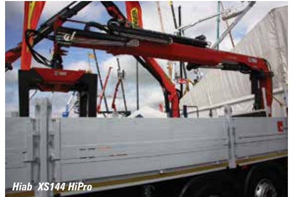
Hiab XS144 HiPro