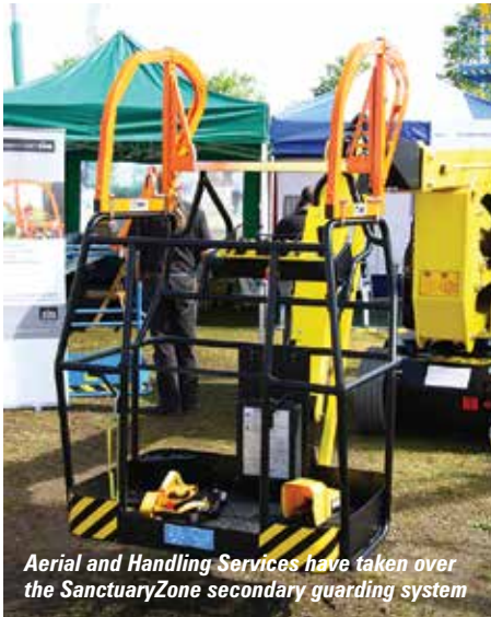
Aerial and Handling Services have taken over the SanctuaryZone secondary guarding system