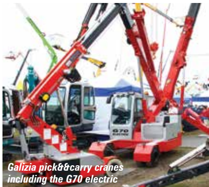
Galizia pick&carry cranes including the G70 electric