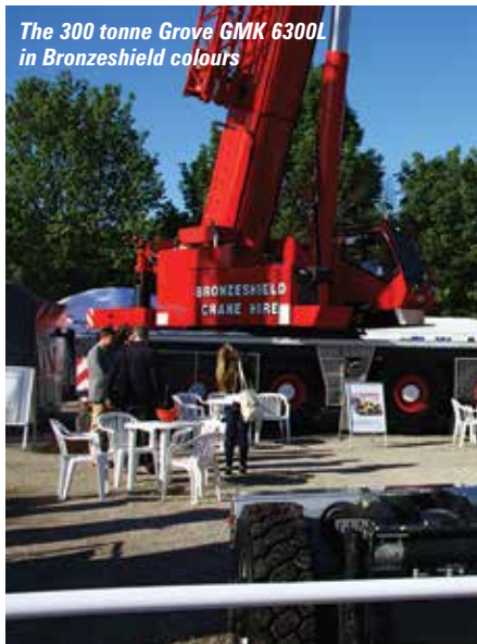
The 300 tonne Grove GMK 6300L in Bronzeshield colours