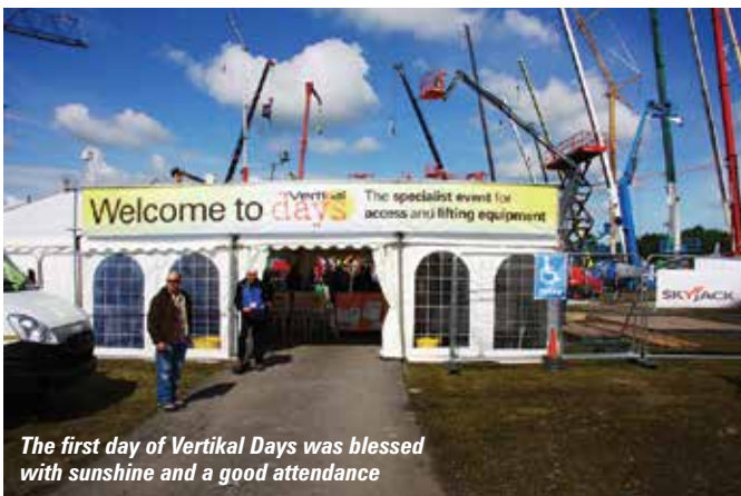
The first day of Vertikal Days was blessed with sunshine and a good attendance