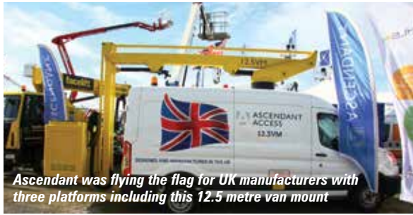
Ascendant was flying the flag for UK manufacturers with three platforms including this 12.5 metre van mount