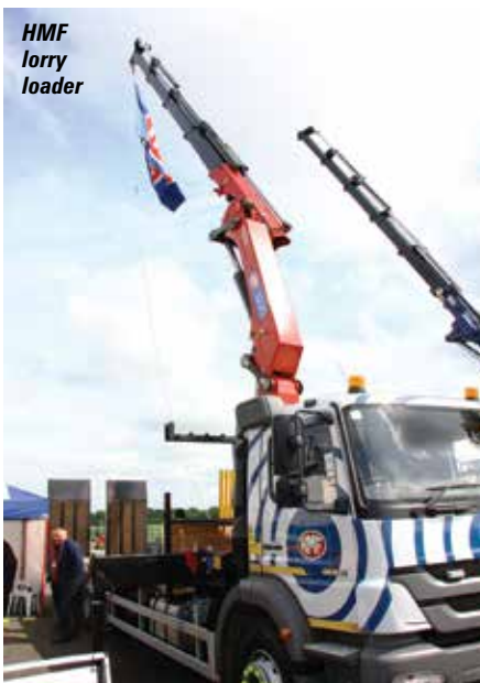
HMF lorry loader