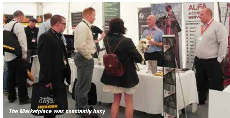
The Marketplace was constantly busy