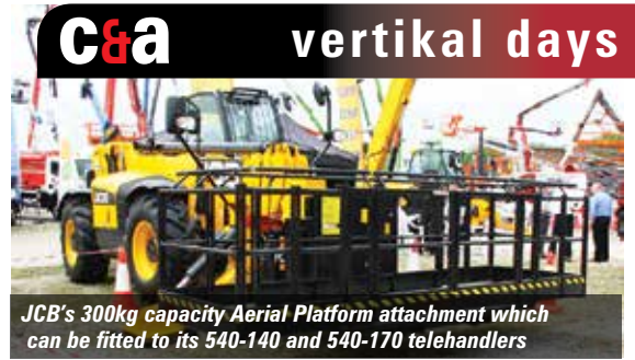
JCB's 300kg capacity Aerial Platform attachment which can be fitted to its 540-140 and 540-170 telehandlers