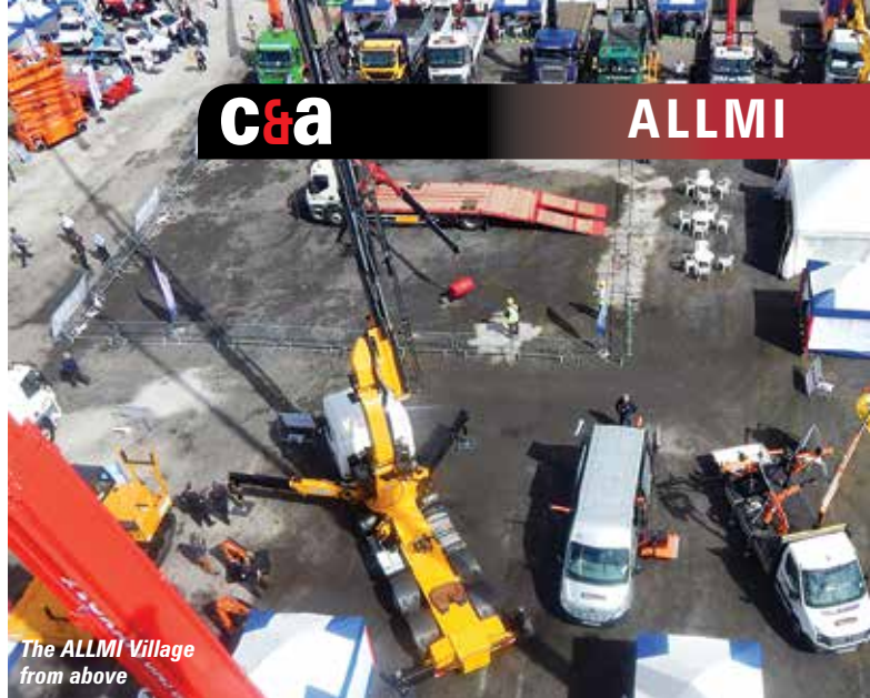
The ALLMI Village from above

ALLMI stand and within the wider ALLMI Village demonstrates the profile of the association and its members, as well as the demand for our training courses and various industry services. As expected, the visitor numbers increased once again and as we always find at Vertikal Days, the quality of delegates was excellent, with those present representing a wide range of industry sectors and all having a genuine interest