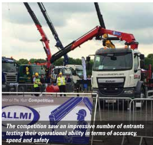
The competition saw an impressive number of entrants testing their operational ability in terms of accuracy, speed and safety