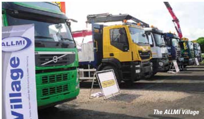
The ALLMI Village

this was our busiest and most successful Vertikal Days show to date. The level of activity on the