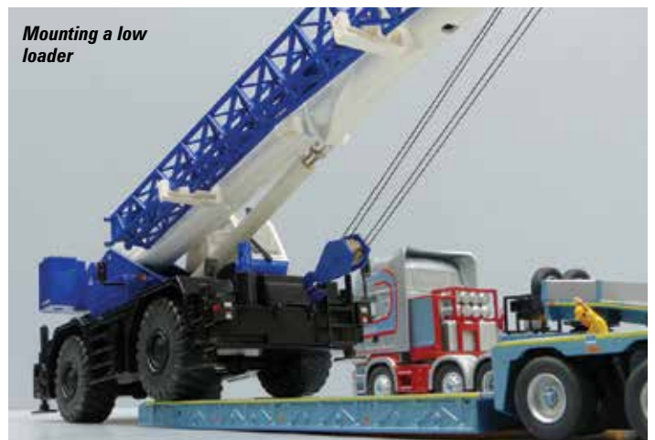
Mounting a low loader