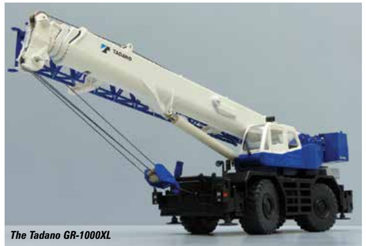
The Tadano GR-1000XL