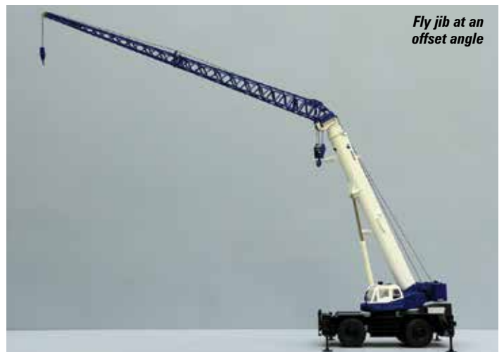
Fly jib at an offset angle