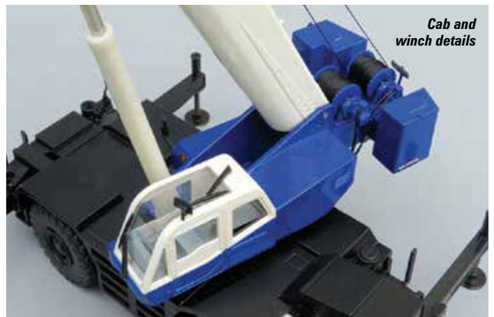
Cab and winch details