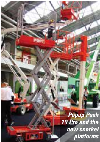
PopUp Push 10 Pro and the new snorkel platforms

But what of Pop-Up - the originator of the push around? It now has three key models - the Push 6 pro, Push 8 pro and Push 10 pro - with platform heights of two, 2.5 and three metres. These are sold direct in the UK and via the Snorkel distribution network overseas. Features now include automatic anti-surf brakes, emergency lowering, tilt sensor and saloon gates.