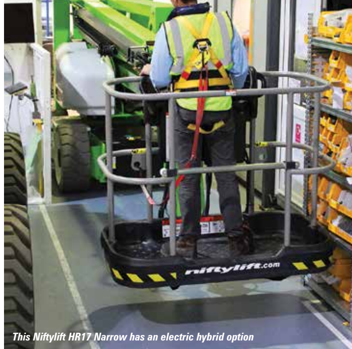
This Niftylift HR17 Narrow has an electric hybrid option

Last October Niftylift launched the 28 metre HR28 Hybrid - the world's largest battery electric powered boom. It is by far the lightest for its