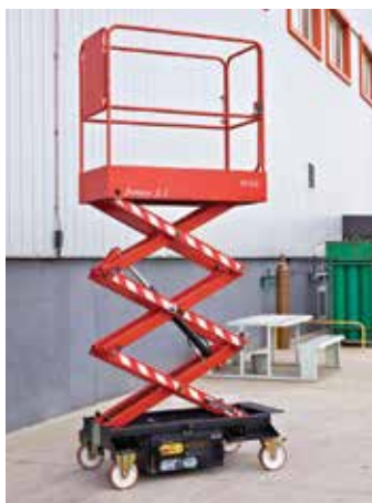
The expanding ELS Makine access range includes this 5.3 metre working height Junior 5.5 push around.