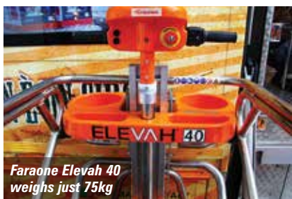
Faraone Elevah 40 weighs just 75kg

Its range of aerial platforms has expanded over recent years but all are compact and lightweight and largely made of aluminium. The company is looking for dealers for its interesting range of push around and self-propelled platforms with working heights of up to eight metres. Its latest platform is the new Elevah 40 which has a working height of four metres and weighs just 75kg with a platform capacity of 100kg enough for one person and