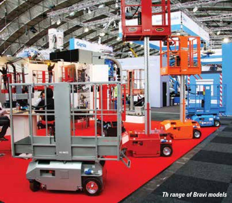
Th range of Bravi models

years, has evolved into the Leonardo HD, the main model in the current Bravi range.