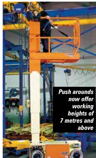
Push arounds now offer working heights of 7 metres and above

The final option is dependent on having a telehandler on site - perhaps for lifting and carrying items or unloading items from a wagon. There are now various access attachments for telehandlers which have the advantage of a large work area and good basket capacity combined with reasonable outreach. Whatever your needs there should be a safe and efficient method of working at height. Make sure you plan the work and book the equipment well in advance so that the work proceeds as smoothly, safely and as quickly as possible.