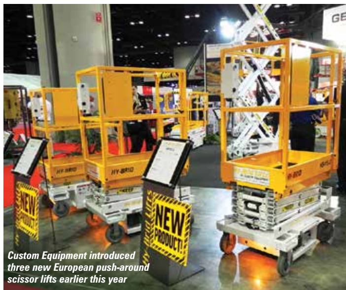
Custom Equipment introduced three new European push-around scissor lifts earlier this year

Italian manufacturer Bravi was way out in front in the low level access game, and yet its first product in 1986 was a self-propelled platform - the Model BP3 - with an 18 metre working height. Three years later it launched the Lui, a nine metre self-propelled mast lift. The five metre Lui Mini came along in 1995 and with constant improvement over the extension.