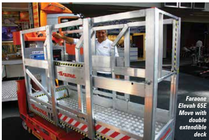
Faraone Elevah 65E Move with double extendible deck

tools. The compact battery powered platform uses a motorbike type twist grip to raise the platform. It is 700mm wide, 900mm long with a stowed height of 1.2 metres.