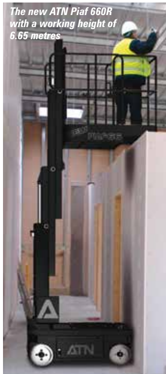
The new ATN Piaf 660R with a working height of 6.65 metres

ATN is the latest company to enter the 12ft self-propelled mast market, joining Snorkel, JLG, Skyjack, Haulotte and Genie with its new 15.3ft Piaf 660R which offers a working height of 6.65 metres with a 380mm platform extension. Platform capacity is 200kg and overall weight is 920kg. Overall width is 780mm while a very tight turning circle allows it to turn within its own width. ATN has developed a larger 7.9 metre version with an extra mast section, but decided that the smaller unit was more