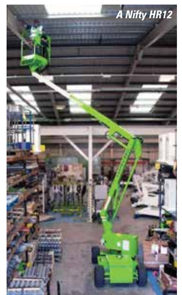
A Nifty HR12

height, will reach the ceiling of a large number of industrial premises while being light, easy to use and compact. Yet all too often people end up with a 26ft slab electric scissor lift, which does offer a larger working platform and in some cases more capacity, but it might cost you more, will be heavier and might be a challenge to squeeze into some areas.