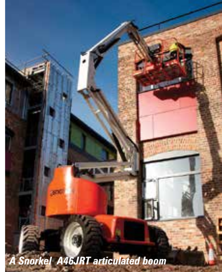
A Snorkel A46JRT articulated boom