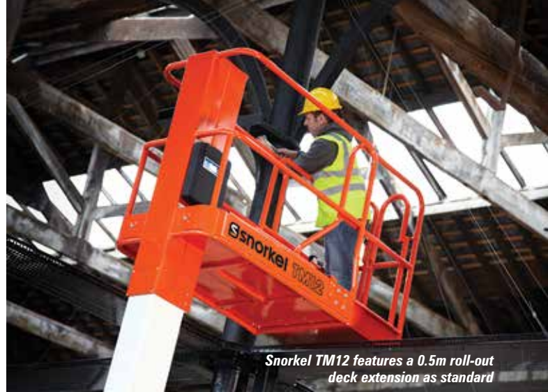
Snorkel TM12 features a 0.5m roll-out deck extension as standard

The British always like to think of themselves as inventors and innovators, at the cutting edge of new developments. For the past two to three hundred years this has probably been the case, having created many of the life-changing inventions from steam engines and railways to the computer, jet engine, World Wide Web, electric motor - the list is endless. In the access sector this includes the low level push-around scissor lift. In its eight year existence, it has totally transformed low level working, driven in the UK by changes to working at height legislation but now becoming more popular in other parts of the world particularly Western Europe and the Middle East.