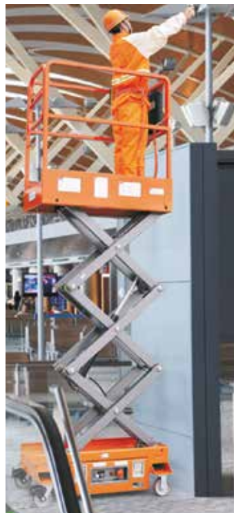
The Dingli JCPT0507 has 240kg capacity and five metre working height.

Dingli is leading a new charge into the low level market by Chinese manufacturers, it offers two push arounds - the five metre JCPT0507 with 240kg capacity, weighing 366kg and the 5.9 metre JCPT0607 which has the same platform capacity but is 30kg heavier.