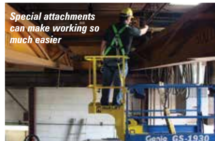
Special attachments can make working so much easier