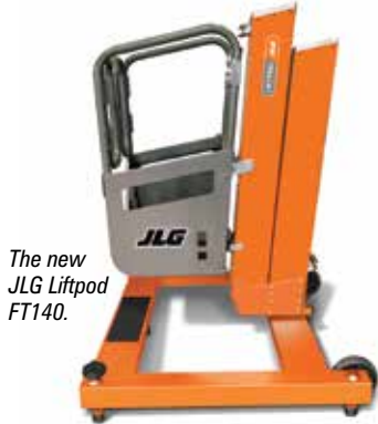
The new JLG Liftpod FT140.

JLG is obviously committed to this concept and launched a larger generation Liftpod - the FT140 - at Conexpo earlier this year. Retaining the key Liftpod features, it is simple to assemble, operate and transport and has the same 150kg capacity, but offers a significantly improved working height of just over six metres. The FT140