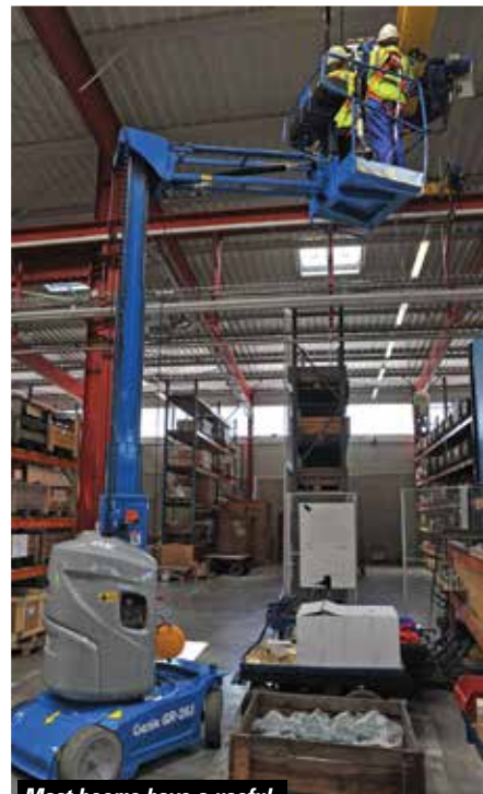
Mast booms have a useful up and over capability