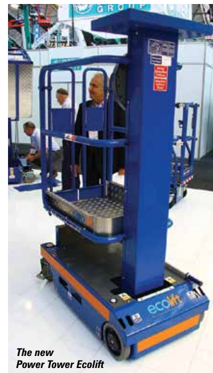
The new Power Tower Ecolift