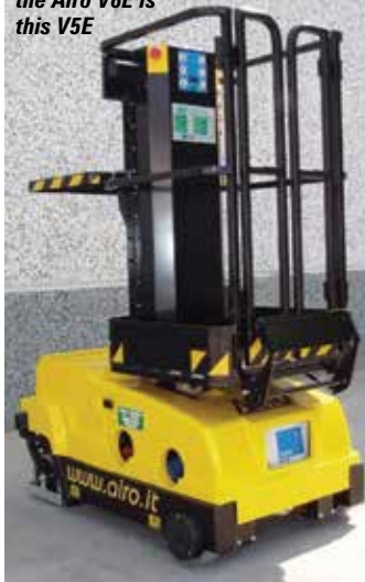
Smaller brother of the Airo V6E is this V5E

working height of 5.5 metres and a moveable loading platform capable of carrying up to 90kg for stock picking duties.