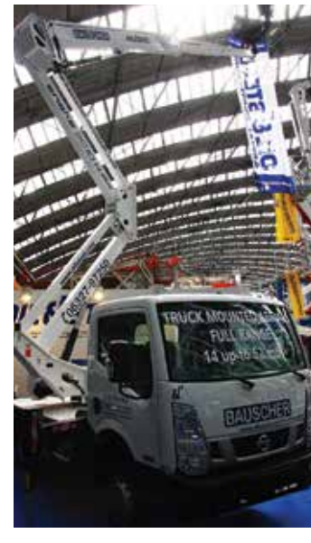
Oil&Steel launched the new 20 metre Snake 2010 H Plus which now has the option of vertical or A frame outriggers. Maximum basket capacity is 250kg and the first has been sold to German rental company Bauscher.