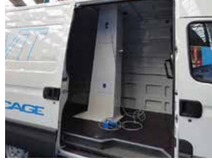
Socage Forste 12VT van mount.