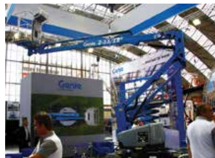
One of the stars of the show -Genie's new Z-33/18 articulated boom.