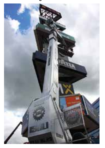
Isoli's range topping 36 metre PTJJ36 launched at Bauma last year.