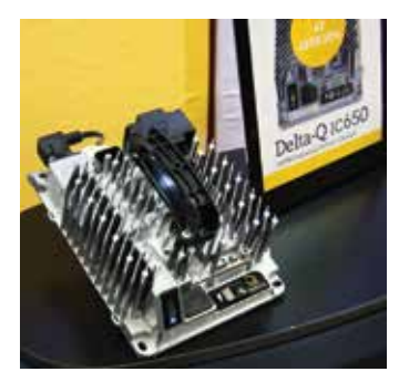
Delta-Q's new IC-650 battery charger.