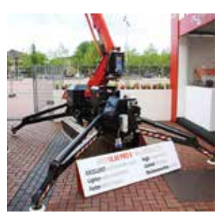
Platform Basket showed its lithium powered 18.90 PRO E spider.