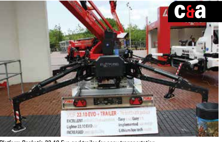
Platform Basket's 22.10 Evo and trailer for easy transportation.