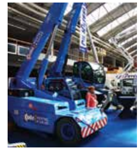
JMG pick&carry cranes on distributor Colle stand.