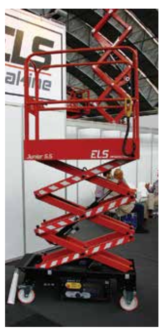
ELS Makine's smallest push around the Junior 5.5.