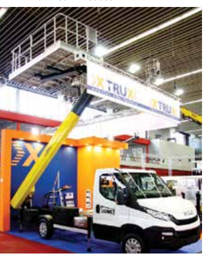
XTRUX also showed this unusual Solar 16 metre truck mount with 400kg capacity and 4.5 metre outreach.

Looking at the exhibitors there were a few notable exceptions with Niftylift and Haulotte being the major manufacturers not attending as well as numerous smaller companies however the exhibition still had plenty for visitors to see, particularly if you were looking at mainstream products. There were also several specialist manufacturers including France Elevateur, Custers and XTRUX showing products that will be covered in the September issue of Cranes & Access.