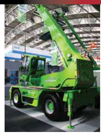
Merlo has plenty of news for ag users of its telehandlers but construction users must wait a bit longer for improvements to the cab and modularisation or major components such as boom, frame, cab and engine.