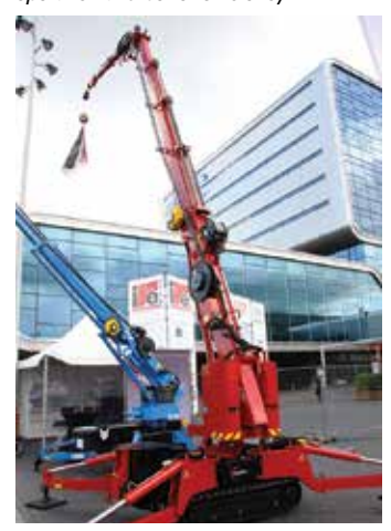
Several mini crane manufacturers were also at the show including Hoeflon.