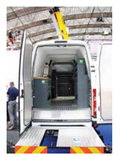
Co.me.t also showed the 14 metre with jib pillarless van mount.