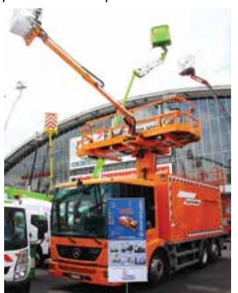
France Elevateur showed its 105 PTO-2 - one of seven sold to Kummler+Matter for working on the Swiss tram system. The unit has a five person capacity with two booms either side of the main platform.