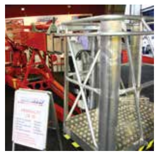
Denka Lift - now owned by Rothlehner - showed this 18 metreDenka DL18.