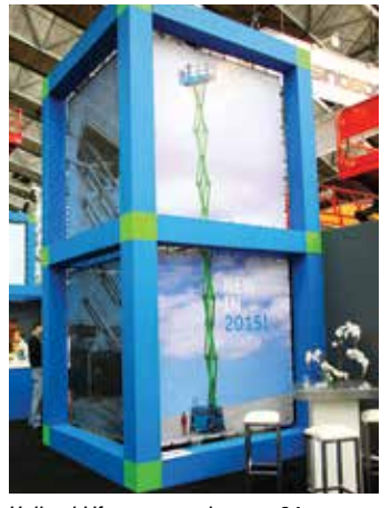
Holland Lift announced a new 34 metre narrow scissor lift to be launched next year and also that it is concentrating on scissors above 16 metres.

Manitou also showed its new Safe Man anti-entrapment system which will shortly be available for all models. Holland Lift unveiled its first true hybrid scissor lift and announced a new 34 metre ultra narrow model for next year.