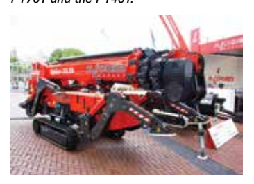
The 33 metre Platform Basket 33.10 shown as a prototye at Bauma last year.