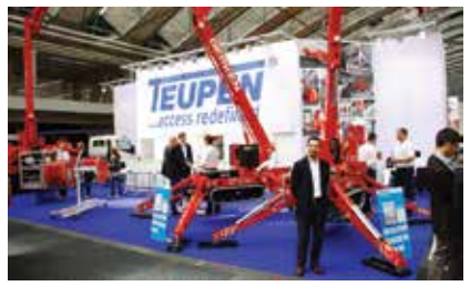
Teupen showed off its latest range of tracked spiders.