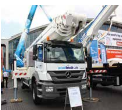
Bronto Skylift launched its 47 metre S 47 XR, the unit on the stand was sold to Swiss rental company Maltech, part of an order for four S 47 XRA's and one S 56 XR.