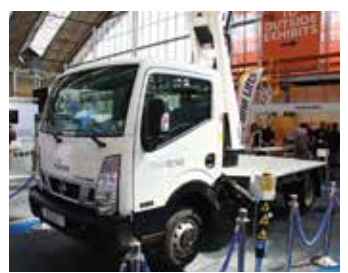
GSR was showing its latest truck mount - the22.5 metre B230T on a Nissan Cabstar chassis.