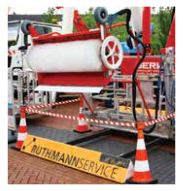
Hy-Lift showed this access platform cleaning attachment on the Ruthmann stand.