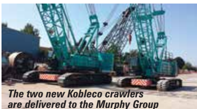
The two new Kobelco crawlers are delivered to the Murphy Group

UK contractor Murphy Group has taken delivery of two new Kobelco crawler cranes - a 135 tonne CKE1350G and a 100 tonne CKE900G - which are now working on the £177 million Thames Water Authority upgrade to the Deephams Sewage Works in Edmonton, East London - one of London's largest sewage works. The new cranes join three other Murphy-owned G Series Kobelco crawler cranes on the job, including two CKE1100G and a BM800G.