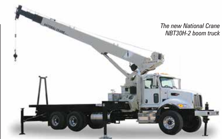
The new National Crane NBT30H-2 boom truck