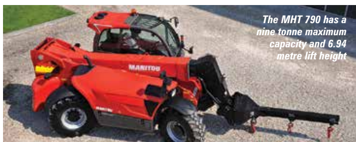
The MHT 790 has a nine tonne maximum capacity and 6.94 metre lift height

Manitou has launched two new large capacity telehandlers for the Australia, New Zealand and Oceania markets. The MHT-X 790 and 1490 have lift capacities of nine tonnes with lift heights of seven and 14 metres respectively.