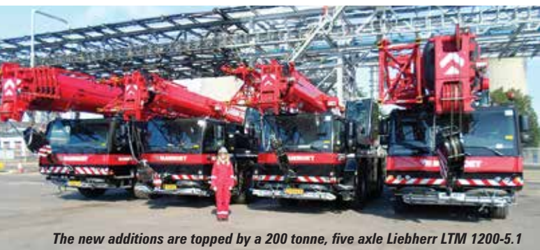
The new additions are topped by a 200 tonne, five axle Liebherr LTM 1200-5.1

For more information see the loader crane feature on page 27.