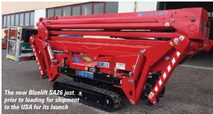
The new Bluelift SA26 just prior to loading for shipment to the USA for its launch

The first customer that will benefit from this improvement is CTE's German dealer, Hematec Arbeitsbühnen with the delivery of a B-Lift 390HR, mounted on a two axle 18 tonne Mercedes Antos chassis. The unit offers 26.3 metres of outreach from its three section main boom, three section jib and secondary jib. The machine's working envelope is automatically controlled to match the weight on the platform and the actual outrigger configuration selected.