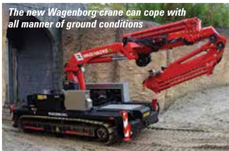
The new Wagenborg crane can cope with all manner of ground conditions

The stowed crane measures 5.4 metres long, with an overall width of 2.4 metres and a height of 2.3 metres. Once in place with the beam and jack outriggers set, the base boom offers up to 12.8 metres of reach with 1.8 to 8.6 tonnes capacity. The fully extended boom and jib has a maximum hook height of 22.2 metres with lift capacities of between 450kg and 3.3 tonnes.