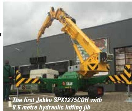
The first Jekko SPX1275CDH with 8.6 metre hydraulic luffing jib

Capacity on the jib is 1.5 tonnes. The crane is powered by an Isuzu diesel and a 400v electric motor for working indoors or in noise sensitive environments. Pick & carry/free on tracks capacity is two tonnes through 360 degrees.