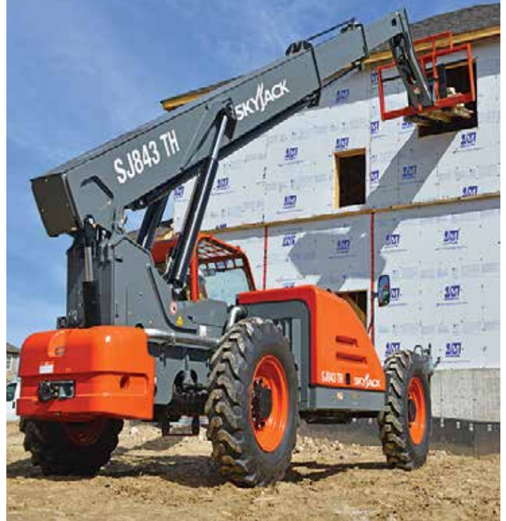
The new machines can be easily converted from closed to open cab