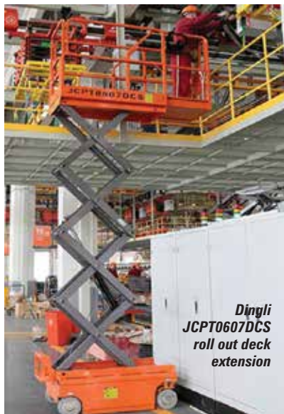
Dingli JCPT0607DCS roll out deck extension