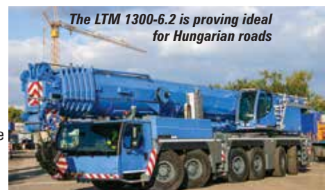
The LTM 1300-6.2 is proving ideal for Hungarian roads

Managing director László Ács said: "The new Liebherr cranes will allow us to erect and dismantle our 200 strong tower crane fleet effectively and quickly. The crane's compact, manoeuvrable LTM 1300's six-axle carrier is ideal for the Budapest roads and congested sites."