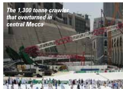
The 1,300 tonne crawler that overturned in central Mecca

The department also urged contractors to take a number of protective measures to avoid a repeat of the crawler crane overturn in Mecca on September 11th. These include regularly checking wind speeds and to stop operating cranes when wind speeds exceed safe operational levels, ensure that crane operators have adequate training and certification and have ready access to copies of operating and maintenance manuals, making the crane's operating area visible and keeping enough space for the movement while loading and unloading heavy material. Operators must also check the crane's slew brake system to ensure smooth operation and weather vane capability.