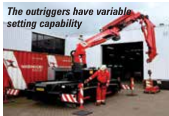
The outriggers have variable setting capability