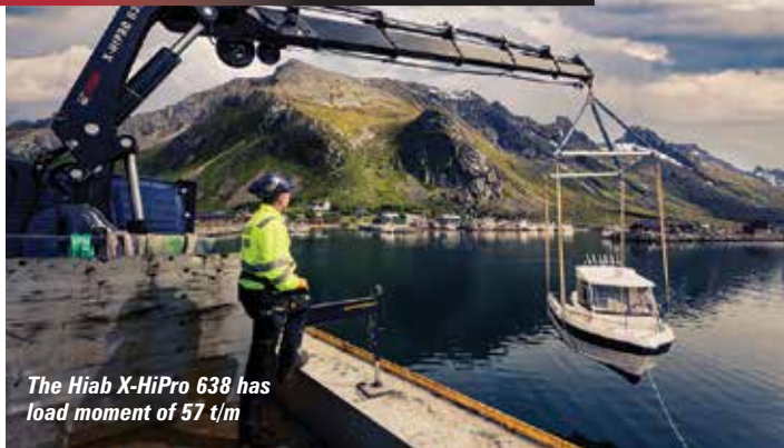
The Hiab X-HiPro 638 has load moment of 57 t/m