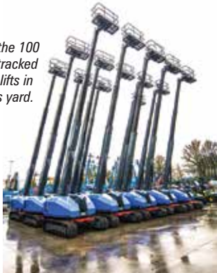
14 of the 100 Aichi tracked boom lifts in Collé's yard.

The two different models share most of their components and structure parts, but the SR14CJ has the additional articulating jib, providing the additional height. The company will hold a large quantity of this shipment in its sales inventory in the Netherlands, ready to provide buyers with immediate delivery.