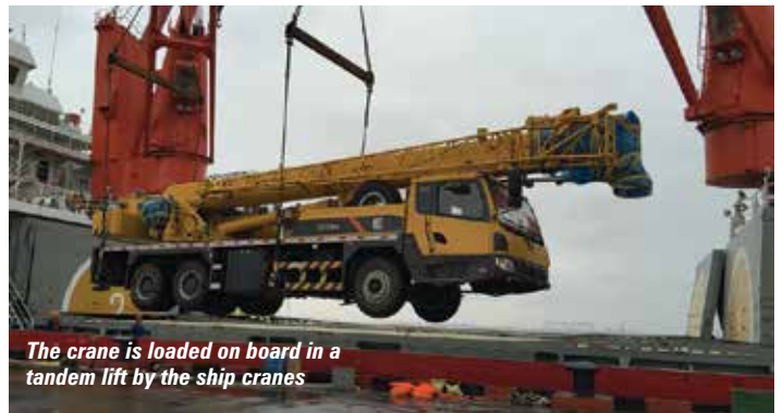
The crane is loaded on board in a tandem lift by the ship cranes

LiuGong signed a special equipment supply agreement with the Polar research centre of China in 2012 and since then has sent several machines, including a previous TC250-4 crane. Modified to handle extreme conditions, the crane will be used for loading and unloading cargo along with building and repair work at the research station.