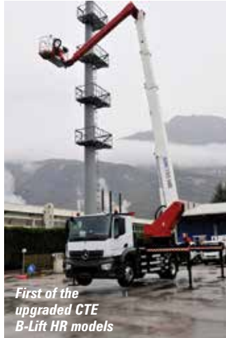
First of the upgraded CTE B-Lift HR models

The High Range is CTE's premium product line and features a three to five section main boom, a telescopic jib and a secondary jib, along with proportional controls with simultaneous operation of all functions, a vehicle cab anti-collision device and 180 degrees platform rotation. The High Range includes the 39 metre B-Lift 390HR, the 42 metre B-Lift 430HR, 50 metre B-Lift 510HR, topped out by the 61 metre B-Lift 620 HR.