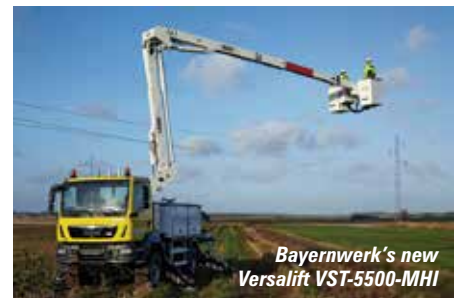
Bayernwerk's new Versalift VST-5500-MHI

Maximum working height is 19.5 metres, with an outreach of 11.7 metres and platform capacity of 130kg in each of the two buckets. The unit is intended for hotline work on live power lines in rough terrain conditions and is insulated to 69 kV, in compliance with ANSI 92.2 Cat. B. The material handler has a capacity of 454kg. The unit was purchased through Time-Versalift's German distributor Ruthmann.