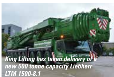
King Lifting has taken delivery of a new 500 tonne capacity Liebherr LTM 1500-8.1

Maximum system height is 142 metres with 108 metres radius. Early next year King will take delivery of a second LTM 1500-8.1 as well as a 750 tonne LTM 1750-9.1.