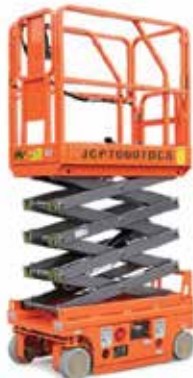
The new Dingli JCPT0607DCS

capacity. The main 1.3m by 700mm platform extends to 1.89 metres with the 600mm deck extension out. The S weighs 880kg and the I 860kg and both offer indoor and outdoor CE ratings, although the S is limited to 5.6 metres outdoors, and the I to 4.5 metres.