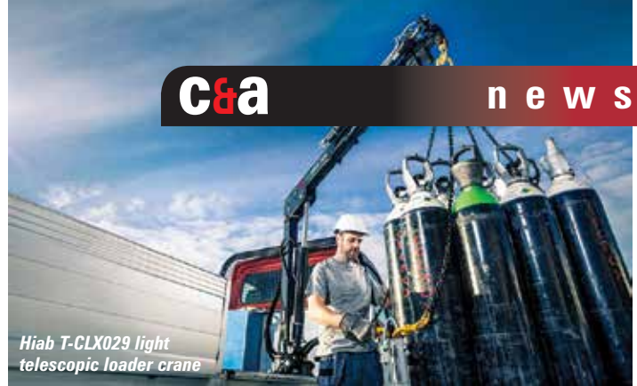
Hiab T-CLX029 light telescopic loader crane