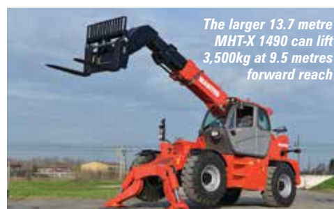
The larger 13.7 metre MHT-X 1490 can lift 3,500kg at 9.5 metres forward reach

The larger MHT-X 1490 can lift to 13.67 metres and can take 3,500kg to its maximum 9.5 metres forward reach. Total weight is 20.8 tonnes and power comes from a Mercedes stage IV engine with gearbox and hydrostatic transmission.