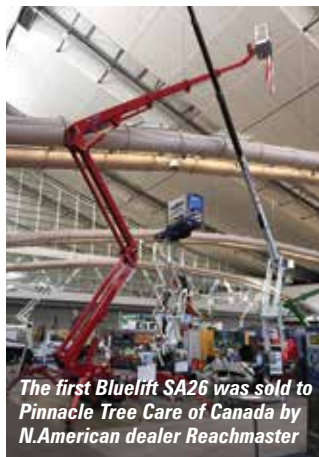
The first Bluelift SA26 was sold to Pinnacle Tree Care of Canada by N.American dealer Reachmaster

The first machine was displayed at TCI Expo, tree care show in Pittsburgh earlier this month and sold to Pinnacle Tree Care or Canada, the company's second Bluelift.