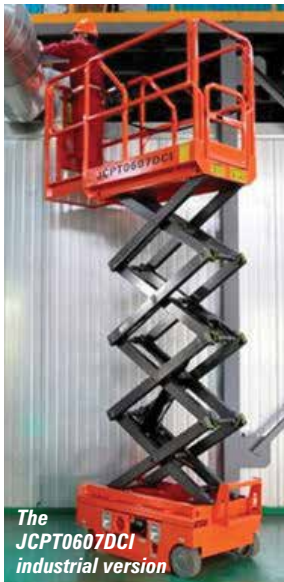
The JCPT0607DCI industrial version