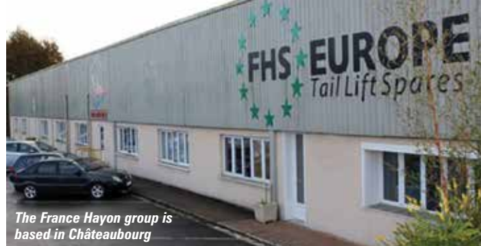
The France Hayon group is based in Châteaubourg