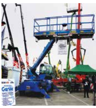
A Genie 360 degree telehandler with large integrated work platform.