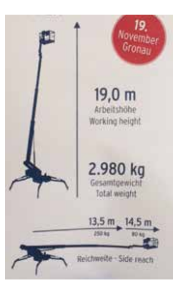
Teupen unveiled details of its new 19 metre Leo19T spider lift that weighs less than three tonnes, offers up to 14.5 metres outreach and up to 250kg platform capacity. A Liebherr Reachstacker

The mood was relaxed and positive with some new products on display and orders placed for others in development. Talk of Bauma was also prominent, with manufacturers keeping new product details under wraps until next year but already excited about 2016.