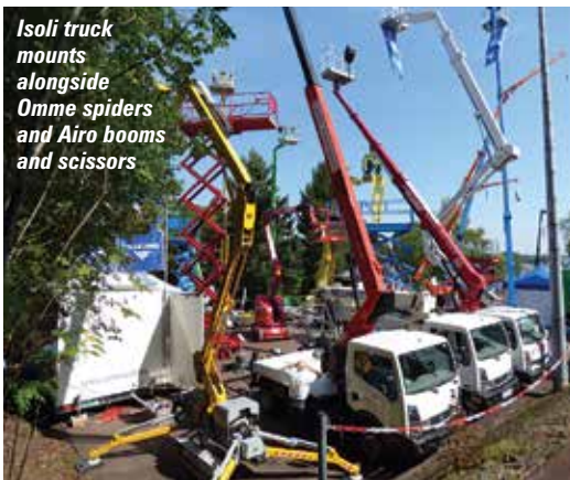
Isoli truck mounts alongside Omme spiders and Airo booms and scissors