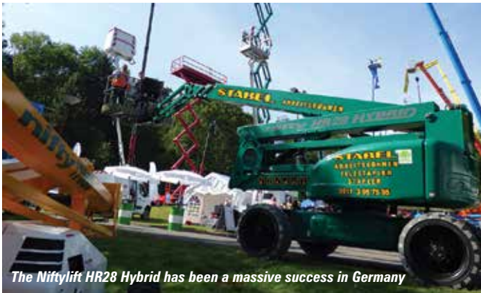
The Niftylift HR28 Hybrid has been a massive success in Germany