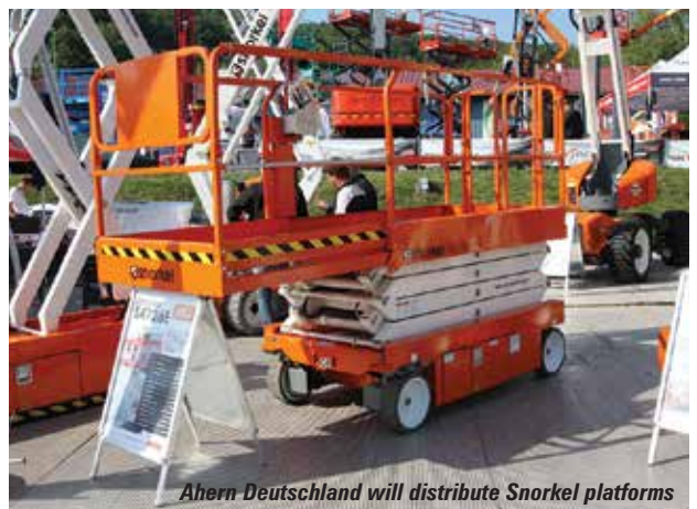
Ahern Deutschland will distribute Snorkel platforms