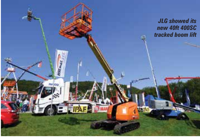
JLG showed its new 40ft 400SC tracked boom lift