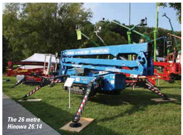
The 26 metre Hinowa 26:14