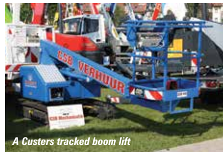
A Custers tracked boom lift