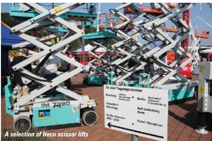
A selection of Iteco scissor lifts