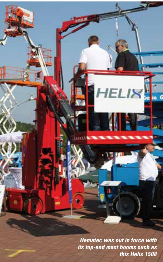
Hematec was out in force with its top-end mast booms such as this Helix 1508