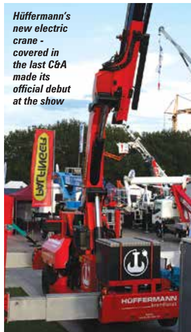
Höffermann's new electric crane - covered in the last C&A made its official debut at the show