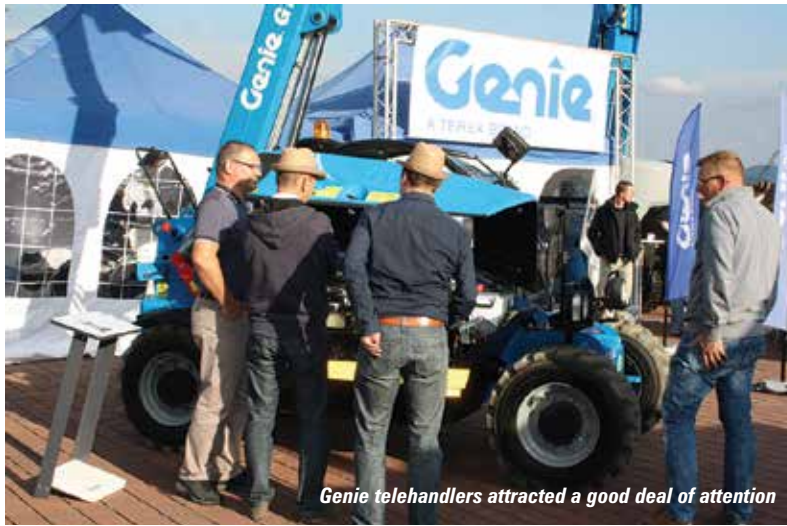
Genie telehandlers attracted a good deal of attention