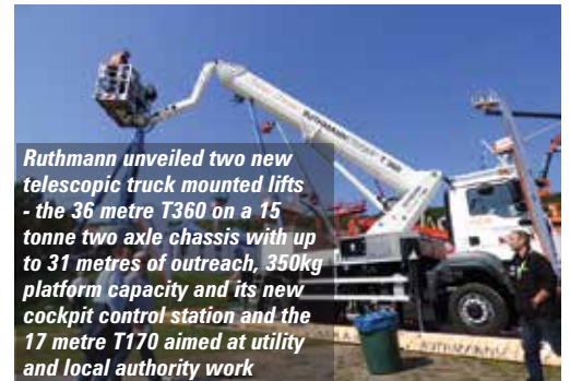
Ruthmann unveiled two new telescopic truck mounted lifts - the 36 metre T360 on a 15 tonne two axle chassis with up to 31 metres of outreach, 350kg platform capacity and its new cockpit control station and the 17 metre T170 aimed at utility and local authority work