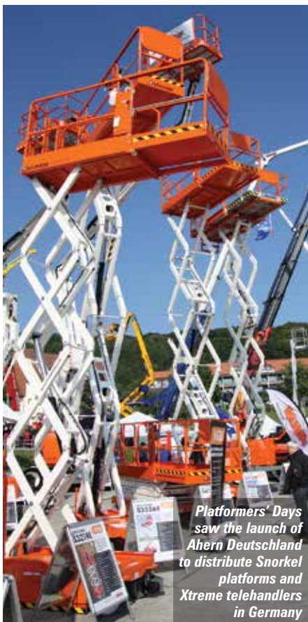
Platformers' Days saw the launch of Ahern Deutschland to distribute Snorkel platformers and Xtreme telehandlers in Germany