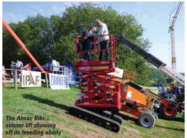
The Almac Bibi scissor lift showing off its levelling ability