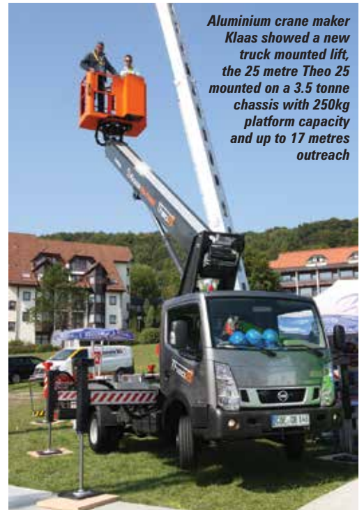
Aluminium crane maker Klaas showed a new truck mounted lift, the 25 metre Theo 25 mounted on a 3.5 tonne chassis with 250kg platform capacity and up to 17 metres outreach