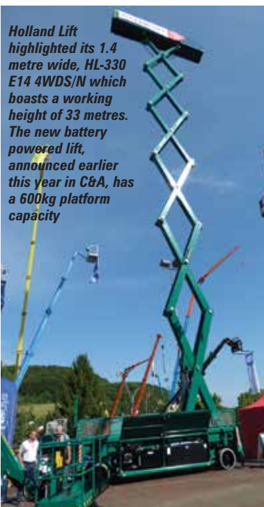
Holland Lift highlighted its 1.4 metre wide, HL-330 E14 4WDS/N which boasts a working height of 33 metres. The new battery powered lift, announced earlier this year in C&A, has a 600kg platform capacity