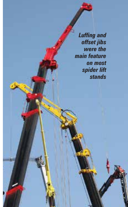
Luffing and offset jibs were the main feature on most spider lift stands