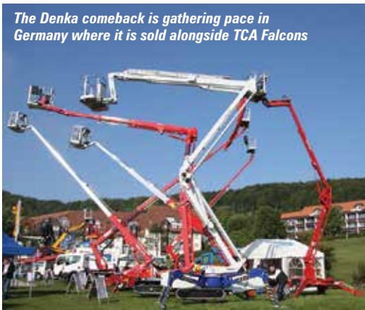
The Denka comeback is gathering pace in Germany where it is sold alongside TCA Falcons