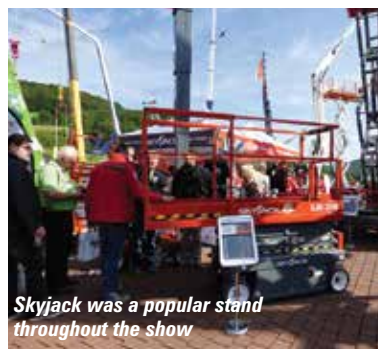
Skyjack was a popular stand throughout the show