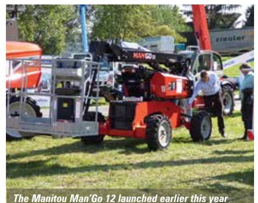
The Manitou Man'Go 12 launched earlier this year