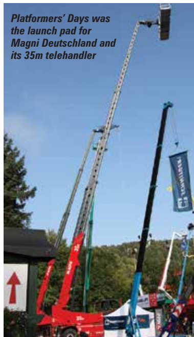
Platformers' Days was the launch pad for Magni Deutschland and its 35m telehandler