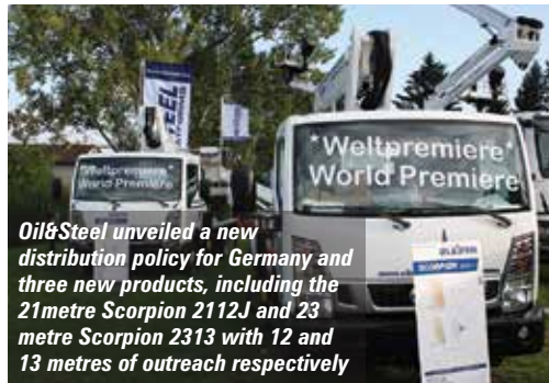
Oil&Steel unveiled a new distribution policy for Germany and three new products, including the 21metre Scorpion 2112J and 23 metre Scorpion 2313 with 12 and 13 metres of outreach respectively

In terms of new products truck mounted lifts were out in front, but another significant difference this year was the increase in the number of mini/spider crane and telehandler exhibitors, not to mention a good selection of glass handling robots. Visitor attendance at around 1,500 was a new record and there was plenty to see. Here is just a small overview of some of the new products on show.