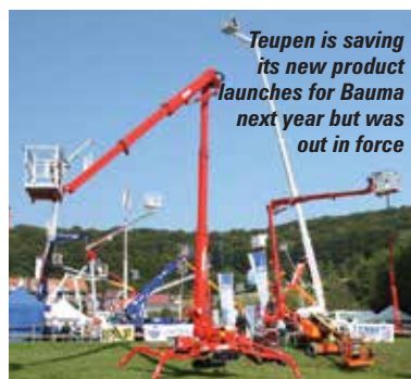
Teupen is saving its new product launches for Bauma next year but was out in force