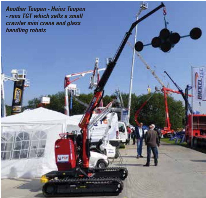
Another Teupen - Heinz Teupen - runs TGT which sells a small crawler mini crane and glass handling robots