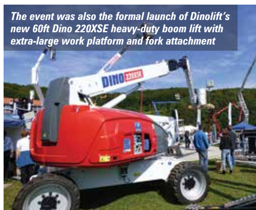
The event was also the formal launch of Dinolift's new 60ft Dino 220XSE heavy-duty boom lift with extra-large work platform and fork attachment