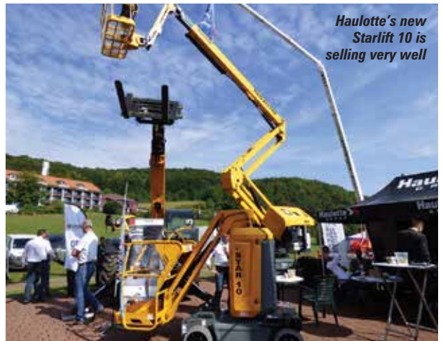
Haulotte's new Starlift 10 is selling very well