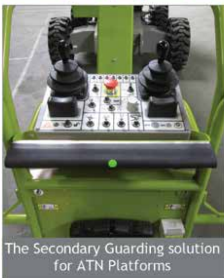
The Secondary Guarding solution for ATN Platforms