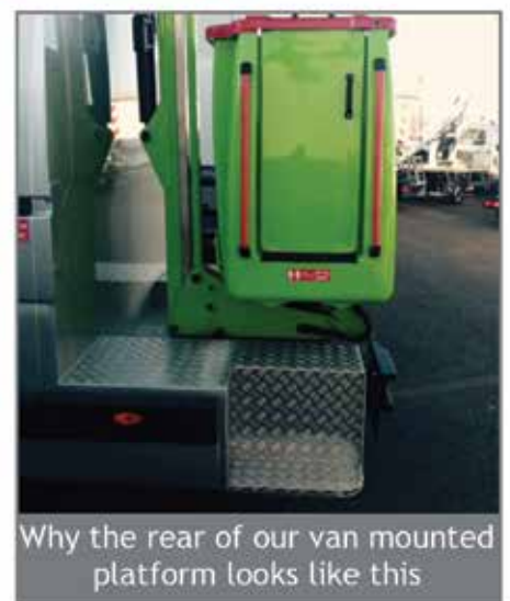
Why the rear of our van mounted platform looks like this

Designed to be different // Built for you