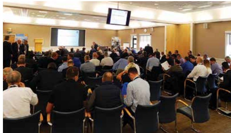
Last year's inaugural CPA Plant Conference was well attended.

New for 2015 is an outdoor area to allow companies to display