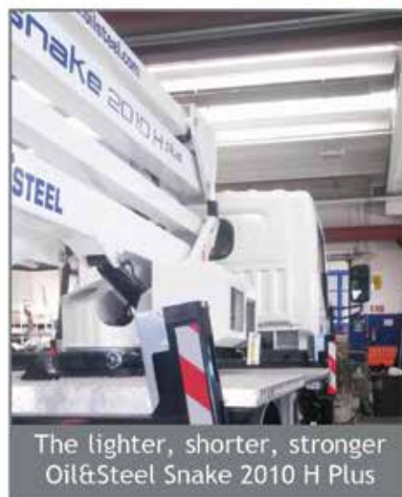
The lighter, shorter, stronger Oil & Steel Snake 2010 H Plus