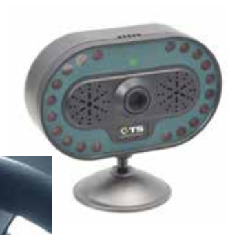
Transport Support's warning system monitors whether a driver is drowsv or inattentive.

The system can either be permanently installed and wired to the ignition or temporarily mounted and powered by a using the vehicle's 12V power socket. Suitable for both day and night use, the system can also be programmed to operate when the vehicle reaches a certain speed.