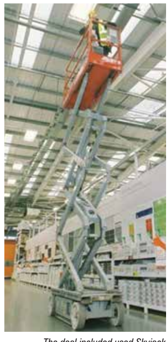
The deal included used Skyjack electric scissors.

The new machines include 50 Genie Z45/25s, 10 Genie GS4047s, 40 Genie GS2632s, five 86ft JLG 860SJs, five 66ft JLG 660SJs and 35 Skyjack SJ46AJs booms. It also includes 60 Youngman X3 pusharound scissors. All booms will be delivered with electronic secondary guarding systems. The company has also purchased 200 used and 100 new Skyjack scissor lifts - mostly 19ft SJ3219 models - in a move that it says demonstrates its ability to capitalise quickly on opportunities in the market.