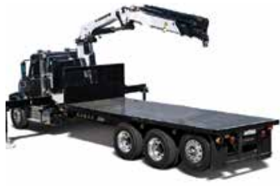
IMT's new 32/222 loader crane.

At its maximum radius of 21.2 metres it can handle up to 800kg, Radio remote controls and the RCL 5300 rated capacity limiter comes as standard, while other features include 360 degree continuous slew and a dual-power plus link system providing a 15 degrees above horizontal jib angle.