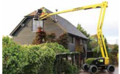
Facelift has taken delivery of 30 Niftylift HR17 boom lifts

The company said that a principal factor for choosing the HR17 was its weight - at just over 4.9 tonnes, it offers reduced transport costs and lower ground bearing pressures on site. Facelift plans to replace all of its self-propelled booms with units fitted with SiOPS secondary guarding, thus working towards an all Nifty boom lift fleet.