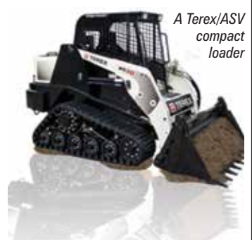
issued Manitex equity and $7.5 million of convertible debt securities. Terex acquired ASV in 2008 for around $488 million.

The deal is expected to raise more than $125 million for Terex, including cash from a recapitalisation of ASV prior to closing, and a significant amount in tax benefits. Terex will use a portion of the cash it receives to acquire $12.5 million of newly