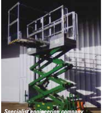
Specialist engineering company Bigore had a photo of one of its latest commissions