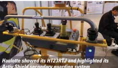
Activ Shield secondary guarding system