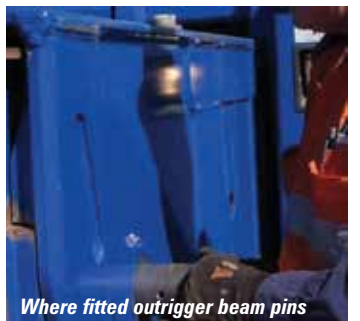
should be used

Many crane users appear to think that the pins supplied are merely an additional safety feature. While most western built cranes may be able to