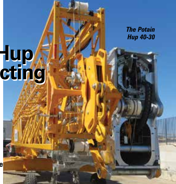
The Potain Hup 40-30

As with the Hup 32-27, the 40-30 features a three section telescopic mast, giving a range of hook heights from 25.6 metres to 30 metres. In transport mode the crane measures 14 metres long. The jib luffs 10 and 20 degrees above horizontal giving a maximum under hook height range of 20 to 40 metres. The company says that 'shortening or extending the jib is a swift and straightforward operation with convenient configurations for both short and long jib lengths'. Deliveries will start in early 2017.