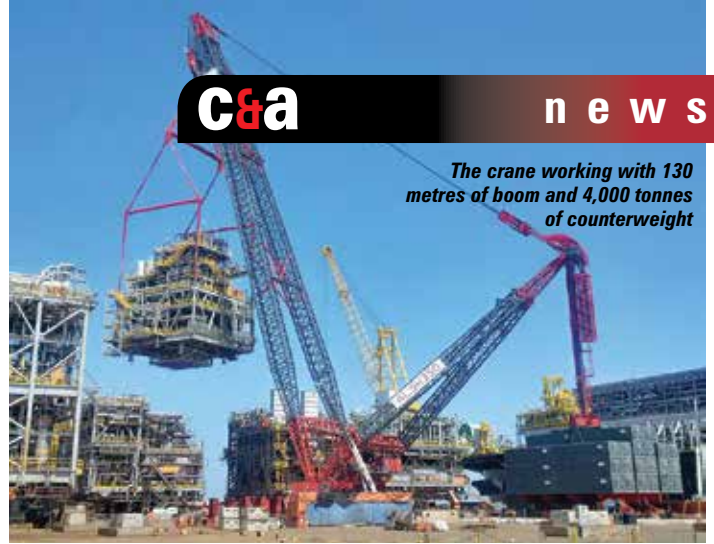
The crane working with 130 metres of boom and 4,000 tonnes of counterweight