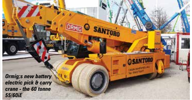
Ormig's new battery electric pick & carry crane - the 60 tonne 55/60iE