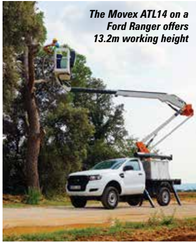
The Movex ATL14 on a Ford Ranger offers 13.2m working height

Working height is 13.2 metres, outreach 6.3 metres and platform capacity 225kg with a two-man fibre glass basket/bucket. The first unit is mounted onto a Ford Ranger and equipped with a flat bed and storage chests and four A-frame outriggers. The weight is said to be low enough for a decent payload.