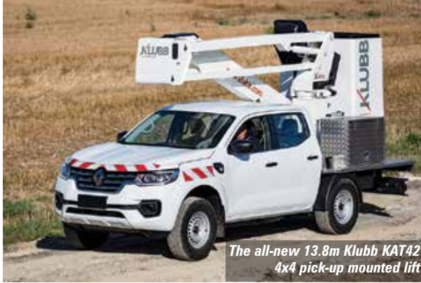
The all-new 13.8m Klubb KAT42 4x4 pick-up mounted lift

French van mounted lift manufacturer Klubb has unveiled an all-new 13.8 metre articulated boom lift, the KAT42 available on a two or four wheeled drive Renault Alaskan pick-up truck.