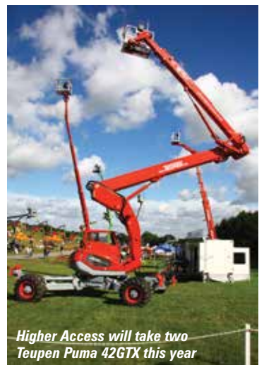
Higher Access will take two Teupen Puma 42GTX this year