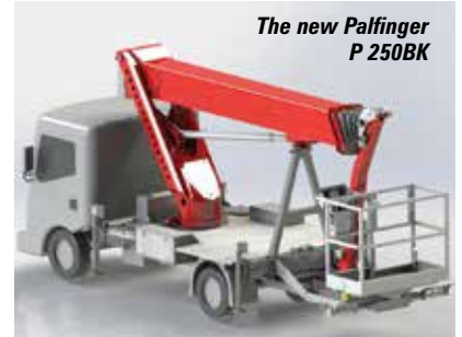
The new Palfinger P 250BK

Palfinger Platforms has added a new 25 metre telescopic truck mounted platform to its Light Class. The P 250BK will be built in Germany and features a five section aluminium boom and articulated jib.