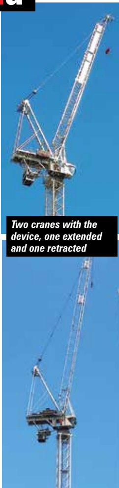
Two cranes with the device, one extended and one retracted

To date IDC has manufactured 32 windsails for four different Terex tower crane models.