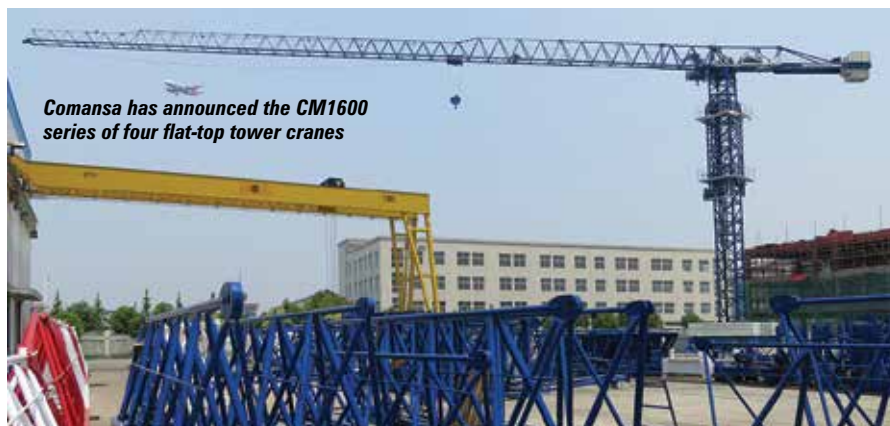
Comansa has announced the CM1600 series of four flat-top tower cranes

jibs and similar tip capacity as the 16CM220. The new models fill the gap between the six to eight tonne Comansa CM1100 Series and the CM2100 Series with lift capacities up to 25 tonnes.