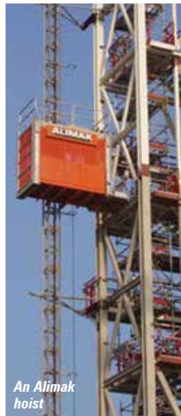
An Alimak hoist