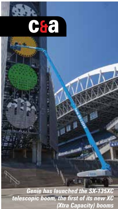
Genie has launched the SX-135XC telescopic boom, the first of its new XC (Xtra Capacity) booms

The SX-135XC features a three section boom and two section telescopic jib providing a maximum outreach of 27.43 metres and a working height of 43.15 metres. Platform capacities with the standard 2.44 metre tri-entry basket with side-swing gate are 450kg with the telescopic jib retracted - giving an outreach of 23.8 metres - or 300kg unrestricted. For a full review of the SX-135XC see the Booms feature starting on page 29.