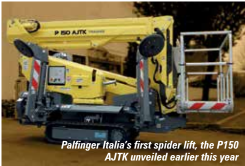
Palfinger Italia's first spider lift, the P150 AJTK unveiled earlier this year

The deal will see Palazzani modify some of its existing spider lifts in the 27 to 52 metre range to provide some product differentiation and meet Palfinger's requirements. Palfinger - which unveiled its first spider lift the 15 metre P150 AJTK at Bauma - will quickly gain a full spider lift product range, allowing its distributors to fully participate in this growing market. Palfinger Italy will develop its own spider lifts up to 27 metres.