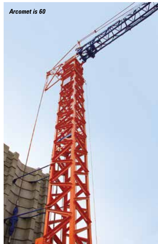
Arcomet is 60

Two years on the company appears to have turned the corner, and has set up a joint venture in the UK with Skyline Tower Crane Services, invested heavily in its German rental fleet to support market growth, and is expanding in Scandinavia and Eastern Europe. Crane production is also rising, with work underway on a larger self-erector.