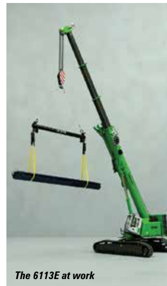
The 6113E at work