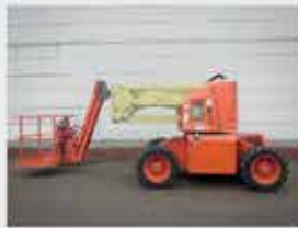
V20838 - Haulotte HA12PX - 2007 Diesel 4x4 - 12,62 Mtr. - 2145 Hrs. € 12.950