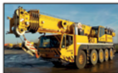
2007 Terex Demag AC120