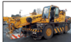
2002-04 Terex Demag AC30 - choice of 11