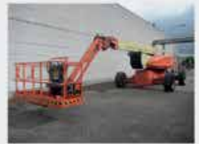
V19786 - JLG 1250AJP - 2006 Diesel 4x4 - 40,1 Mtr. - 4520 Hrs. € 72.500