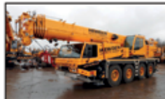
2016 Tadano 70 Ton - choice of 2