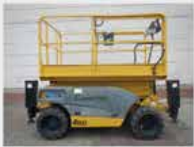
V21494 - Haulotte C100X - 2006 Diesel 4x4 - 10,2 Mtr. - 2178 Hrs. € 8.500