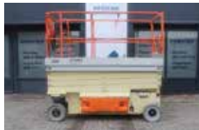
JLG - 3246ES Scissor lifts

Through our long established network of suppliers and by focusing on the purchasing of larger packages of equipment, we always have a diverse inventory of quality used stock on offer.