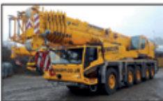
2016 Tadano 220 Ton - choice of 2

Newark Showground, Lincoln Road, Newark-on-Trent, Nottinghamshire, NG24 2NY