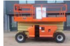
JLG - 4394RT Scissor lifts

Diesel, 4x4x2 15.0m Working Height, 2008 | PHM-Id 08417