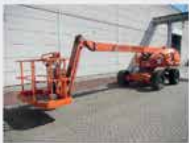
V18845 - Haulotte H16TPX - 2005 Diesel 4x4 - 15,44 Mtr. - 1857 Hrs. € 10.950