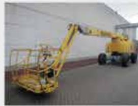
V21216 - Haulotte HA260PX - 2008 Diesel 4x4 - 26 Mtr. - 1199 Hrs. € 33.500