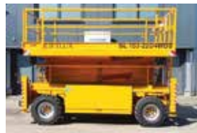
Liftlux - SLI53-22 D4WD Scissor lifts

Diesel, 4x4 Drive, 17.3m Working Height, 2003 | PHM-Id 08326