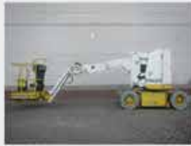
V20903 - JLG E300AJP - 2004 Electric - 11,14 Mtr. - 1711 Hrs. € 11.950