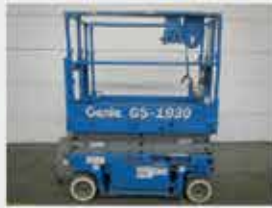
V21637 - Genie GS1930 - 2002 Electric - 7,8 Mtr. - 526 Hrs. € 3.250