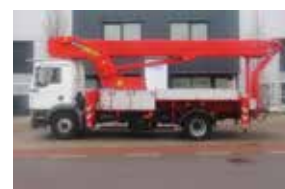
BISON PALFINGER - TKA43KS Truckmounted working platforms

Diesel, 4x2 43.0m Working Height, 2007 | PHM-Id 08758