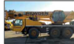
2006-08 Terex Demag AC55L - choice of 14