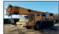
2008 Terex Demag AC100 - choice of 5