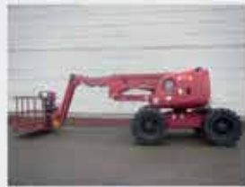
V21846 - Haulotte HA16PXNT - 2004 Diesel 4x4 - 16 Mtr. - 2539 Hrs. € 11.950