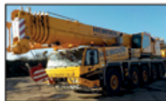
2014-16 Tadano ATF130G-4 - choice of 4