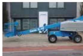
GENIE - S40 Boom lifts

Diesel, 4x4x2 14.0m Working Height, 2007 | PHM-Id 08481