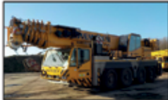
2006-09 Terex Demag AC80-2 - choice of 11