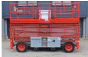
Skyjack - SJ9250 Scissor lifts

Diesel, 4x2 Drive, 17.0m Working Height, 2004 | PHM-Id 08228