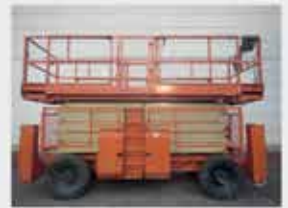
V19788 - Genie GS5390RT - 2006 Diesel 4x4 - 18,15 Mtr. - 434 Hrs. € 17.950