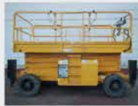
V21784 - Haulotte H15 SX - 2007 Diesel 4x4 - 15 Mtr. - 2323 Hrs. € 12.500