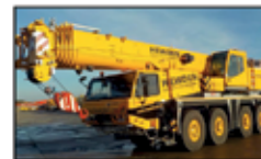
2014-15 Tadano ATF100G-4 - choice of 11