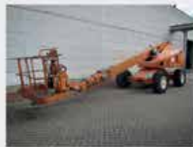
V18855 - Haulotte H21TX - 2008 Diesel 4x4 - 20,8 Mtr. - 2523 Hrs. € 16.950