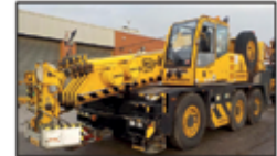
02-03 Terex Demag AC40-1 - choice of 7