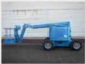
V20235 - Genie Z34-22RT - 2000 Diesel 4x4 - 12,62 Mtr. - 6459 Hrs. € 7.950