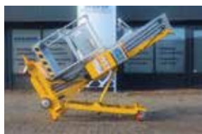
HAULOTTE - QUI3AC Vertical mast lifts

UNUSED, Electric, 12.0m Working Height, 2012 | PHM-Id 08728