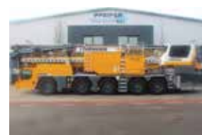
LIEBHERR - MKI40 Tower Cranes

UNUSED, Diesel, 10x6x10, Plus Pack, 2017 | PHM-Id 80078