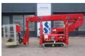
BLUELIFT - C13 Track articulating boom lifts

Bi Energy, 445 hrs 13.0m Working Height, 2013 | PHM-Id 08795