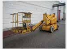
V20195 - Manitou 150AET2 - 2005 Electric - 14,8 Mtr. - 1262 Hrs. € 11.000