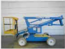
V21930 - Niftylift HR10E - 2002 Electric - 10 Mtr. - /Hrs. € 6.250