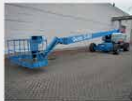
J19153 - Genie S85 - 2007 Diesel 4x4 - 27,9 Mtr. - 1737 Hrs. € 49.500