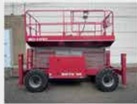
V17600 - Mec 4191RT - 2008 Diesel 4x4 - 14,5 Mtr. - 304 Hrs. € 15.950