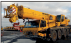
2014 Tadano ATF90G-4 - choice of 6