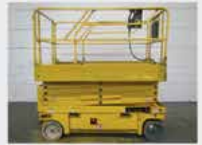
V21510 - Haulotte Compact 12 - 2005 Electric - 12 Mtr. - 219 Hrs. € 5.950