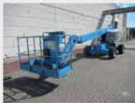
V20230 - Genie S45 - 2001 Diesel 4x4 - 15,7 Mtr. - 5708 Hrs. € 10.500