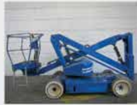
V22023 - Upright AB38N - 2006 Electric - 13,5 Mtr. - 6944 Hrs. € 9.950