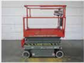
V20130 - Skyjack S3219 - 2007 Electric - 7,8 Mtr. - 185 Hrs. € 3.950