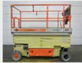
V20869 - JLG 2646ES - 2006 Electric - 9,8 Mtr. - 227 Hrs. € 5.750