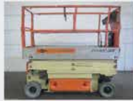
V19790 - JLG 2030ES - 2007 Electric - 8,1 Mtr. - 379 Hrs. € 4.750