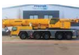
LIEBHERR - LTM1220-5.2 Telescopic Cranes

220t, 10x8x10, Double Jib 60m Boom, 22m + 3x7m jib, 2009 | PHM-Id 08715