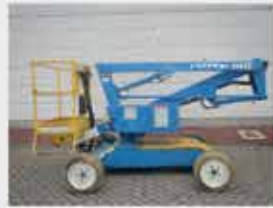
V21962 - Niftylift HR12E - 2002 Electric - 12,2 Mtr. - /Hrs. € 6.500