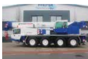
FAUN - ATF 60-4 Telescopic Cranes

60t, 8x6x8 10.4m Boom, 9/16m Jib 1998 | PHM-Id 06014