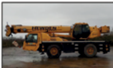
2006-08 Terex Demag AC35L - choice of 12