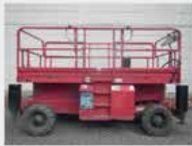
V21768 - Haulotte H125X - 2006 Diesel 4x4 - 12 Mtr. - 2604 Hrs. € 10.950