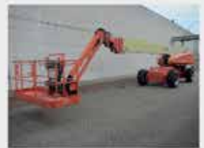
V19924 - JLG 12005JP - 2007 Diesel 4x4 - 38,58 Mtr. - 3626 Hrs. € 69.500