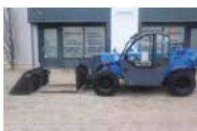
GENIE - GTH2506 Telehandlers

Diesel, 4x4x4 5.0m Lift Height, 2004 | PHM-Id 08664