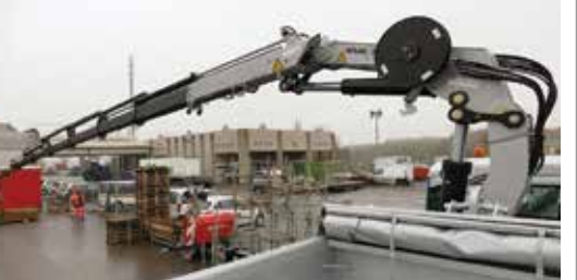
The first Atlas 290.2E arrives in Luxembourg

The 290.2E has a total weight of 5.3 tonnes and offers 410 degrees of slew. The first company to take delivery of the new crane is Luxembourg-based Delvaux through Atlas dealer Carosserie Comes.