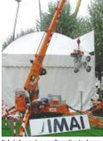
Italy is becoming an alternative to Japan in for the production of mini cranes.

If mobile cranes are you main interest, this as Europe's main crane event in