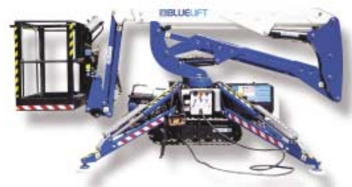
SAIE is the place to see narrow, low weight crawler mounted booms, no fewer than ten producers will be at the show.

cranes. And if you haven't already seen it, you might catch the 130 tonne GMK-5130 that was due in Bologna last year but never made it.