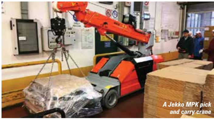
A Jekko MPK pick and carry crane

The MC 580 features a chunky four section, full power telescopic boom with boom nose mounted hook. The counterweight comprises four sections and an extendible wheelbase for additional capacity and greater stability. It has a fully equipped cab with radio remote joystick controls, a seven inch information screen, front wheel AC direct drive, rear 180 degree steer with counter rotating front wheels, allowing it to rotate on the spot through 360 degrees with full load on the hook. Options include a 30 tonne fork attachment, quick fit front levelling outriggers and a winch.