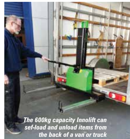
The 600kg capacity Innolift can self-load and unload items from the back of a van or truck

The unit - which when lifting looks like a chicken wishbone - has a bottom frame with two travel wheels at one end with the handle with lift button and brake that the operator holds at the other. A long telescopic cylinder is connected centrally near the wheels to the moveable lifting arm which has a maximum lift of 1.9 metres. Power is supplied by an 18 volt battery pack.