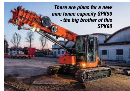
There are plans for a new nine tonne capacity SPK90 - the big brother of this SPK60

New developments include a new colour scheme and decals from next year, the launch of a new MPK05, a new hydraulic jib for the SPX312 and a new nine tonne capacity SPK90 - the big brother of the SPK60.