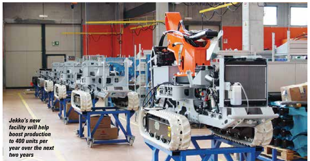
Jekko's new facility will help boost production to 400 units per year over the next two years