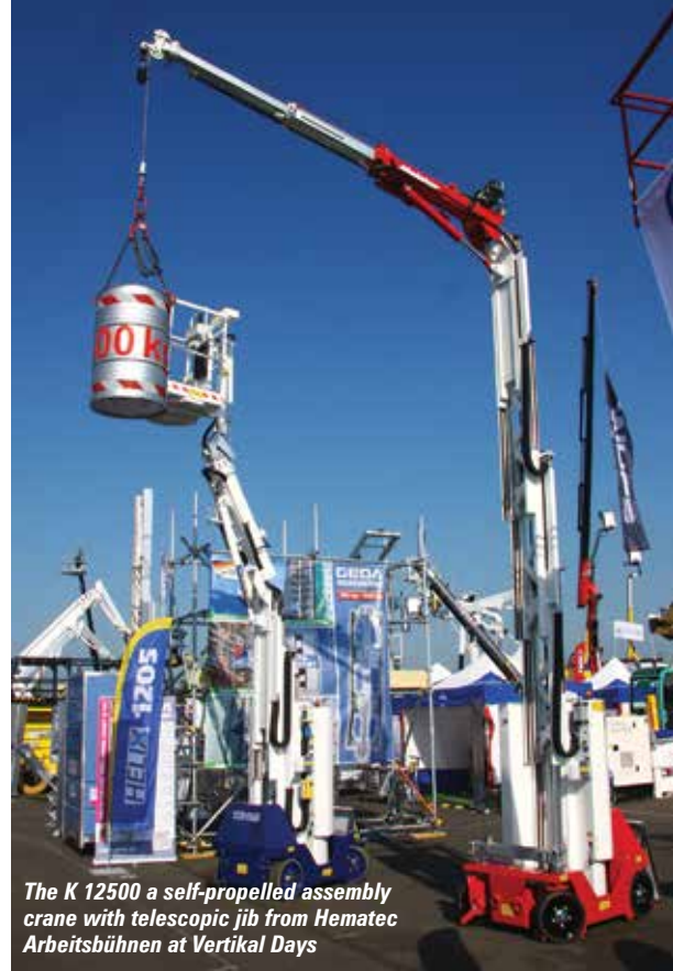
The K 12500 a self-propelled assembly crane with telescopic jib from Hematec Arbeitsbühnen at Vertical Days

As we have already seen, lifting and moving a load in an industrial situation is more about finding the right tool for the job - irrespective of size. This year's Vertical Days