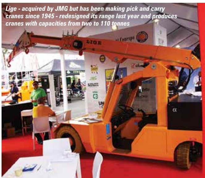
Lige - acquired by JMG but has been making pick and carry cranes since 1945 - redesigned its range last year and produces cranes with capacities from two to 110 tonnes