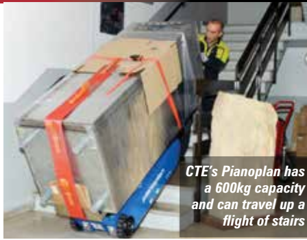
CTE's Pianoplan has a 600kg capacity and can travel up a flight of stairs