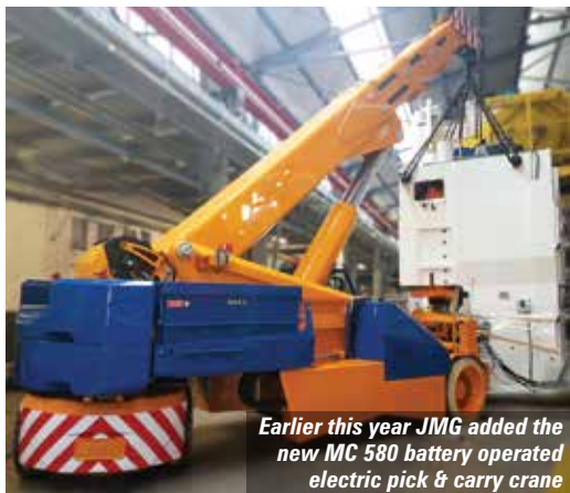
Earlier this year JMG added the new MC 580 battery operated electric pick & carry crane

Other weird and wonderful lifting devices include the SkidCrane. Perhaps not primarily aimed at the industrial lifting market, it is an attachment that converts a skid steer loader into a unit capable of lifting up to 2.3 tonnes and up to 13.1 metres. The SkidCrane is a compact hydraulically controlled crane attachment that is easy to attach, use and transport and ideal for working in confined spaces particularly on flat hard surfaces. Remote controls are also available.