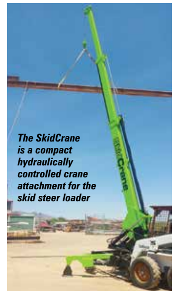
The SkidCrane is a compact hydraulically controlled crane attachment for the skid steer loader