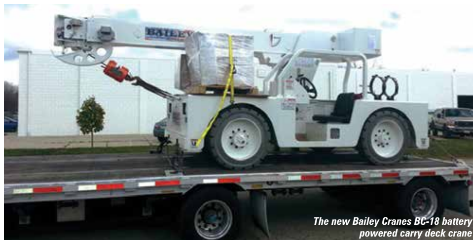
The new Bailey Cranes BC-18 battery powered carry deck crane