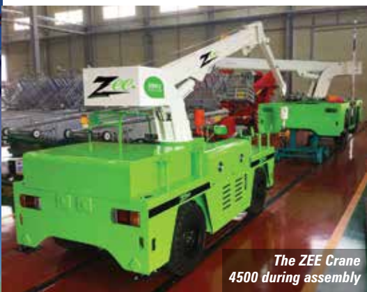
The ZEE Crane 4500 during assembly

Whatever its name it has a maximum tip height of 10.5 metres with a 500kg lift capacity, and a maximum radius of almost five metres with a 300kg load at a height of almost seven metres, or take 500kg to a radius of 3.6 metres. The machine can also slew or travel with its maximum capacity even when over the side. Overall width is just 980mm but the weight however is a fairly hefty 4.8 tonnes. Based on the company's well proven Helix mast boom platform with a three section telescopic luffing jib in place of the basket, the unit is battery operated with direct electric drive and remote controls. The company has so far delivered 12 units to companies such as Audi, Bosch, Borbet, Mercedes-Benz and Volkswagen all of which appreciated its ability to work in restricted space conditions.