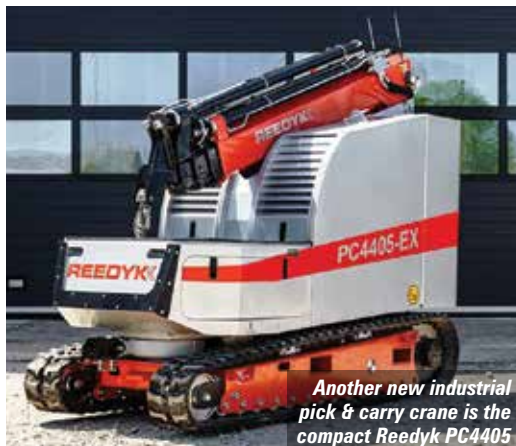
Another new industrial pick & carry crane is the compact Reedyk PC4405