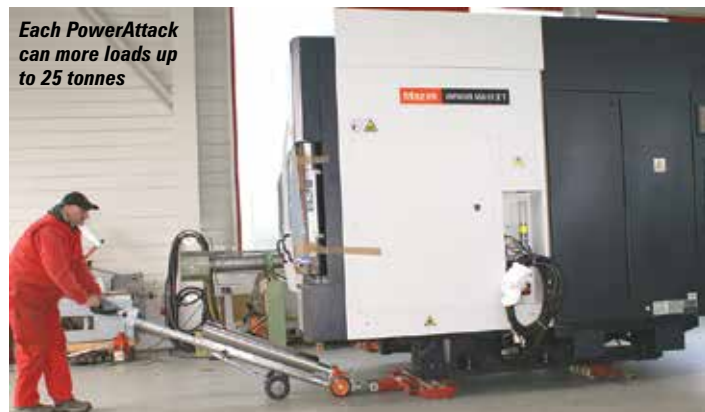
Each PowerAttack can move loads up to 25 tonnes

Another interesting hand operated lifting product aimed at the smaller delivery sector is the Portable Self Loading fork lift from American company Innolift. The very clever product can self-load and unload items up to 600kg from the back of a van or truck and then operate in the same way as a walk behind material/fork lift. Maximum lift height is one metre. Once it has helped load the van it can load itself into the back, ready to unload the cargo at the next stop.