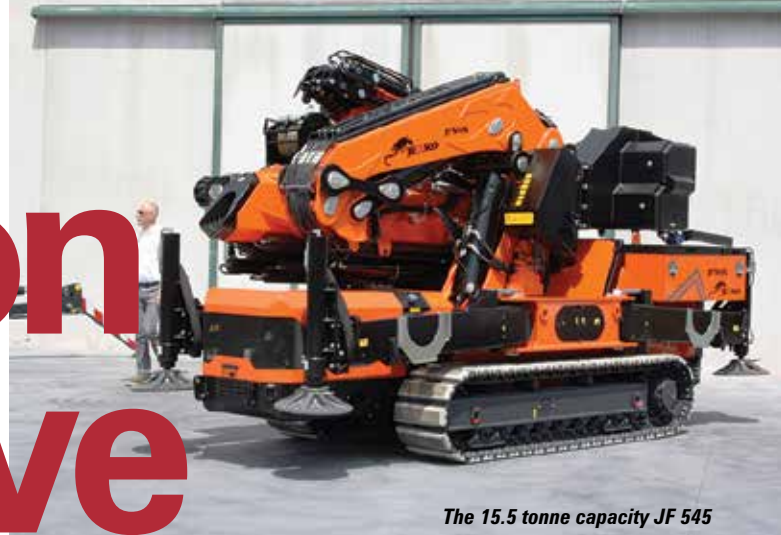
The 15.5 tonne capacity JF 545