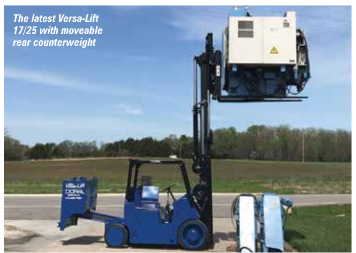
The latest Versa-Lift 17/25 with moveable rear counterweight

the company is expanding and moving to a new facility.