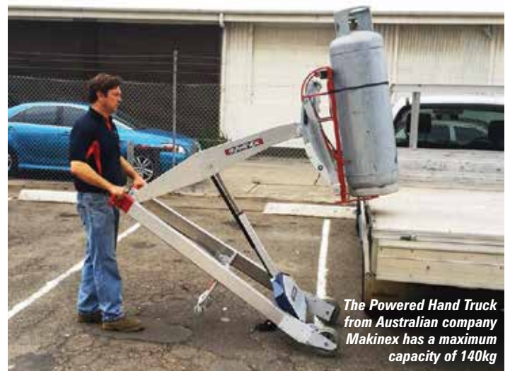
The Powered Hand Truck from Australian company Makinex has a maximum capacity of 140kg