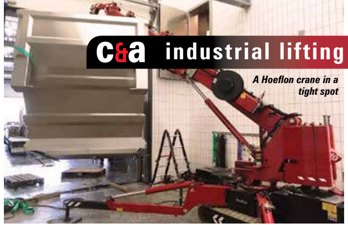
A Hoeflon crane in a tight spot