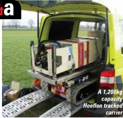
A 1,200kg capacity Hoefton tracked carrier