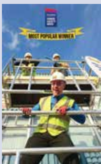
Selfie' winner from 2016 Tower Week