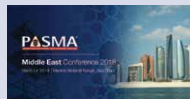
2018 Middle East Conference

Now becoming an established highlight in the PASMA calendar, the 2018 conference will take place at the Marriott Hotel Al Forsan in Abu Dhabi on 14th March. Further details will be announced shortly. More information at www.pasma.ae