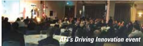
AFI's Driving Innovation event