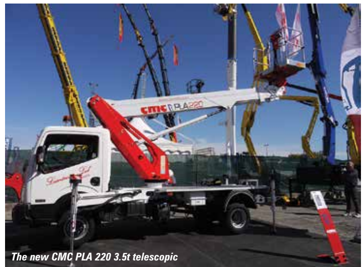
The new CMC PLA 220 3.5t telescopic