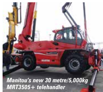
Manitou's new 30 metre/5,000kg MRT3505+ telehandler