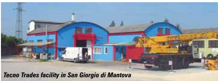
Tecno Trades facility in San Giorgio di Mantova