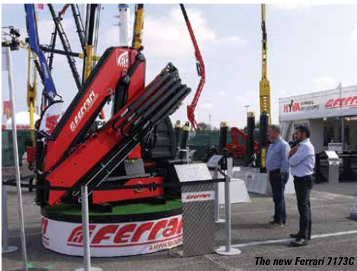
The new Ferrari 7173C