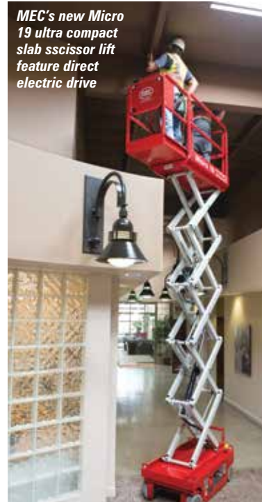
MEC's new Micro 19 ultra compact slab scissor lift feature direct electric drive

Both units are almost certainly built for MEC by Dingli in China to MEC's detailed design changes to existing Dingli products in order to deliver a cost effective product with all the MEC 'bells and whistles'.