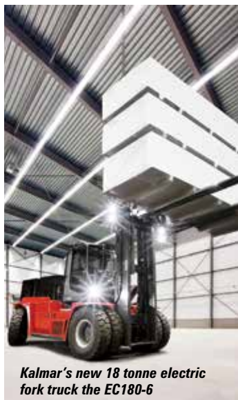
Kalmar's new 18 tonne electric fork truck the EC180-6

Kalmar has launched a range of fully electric forklift trucks with capacities ranging from nine to 18 tonnes and lifts heights to seven metres. The range of 13 models or variations runs from the nine tonne ECG90-6 to the 18 tonne EC180-6 with overall widths of 2.5 metres and gross weights of between 17 and 22.4 tonnes. The forklifts can operate for up to eight hours on a single charge, thanks to an efficient AC drive train.