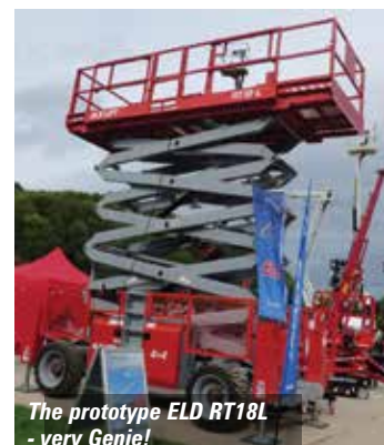
The prototype ELD RT18L - very Genie!