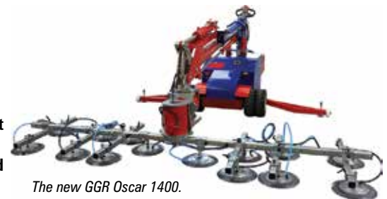
The new GGR Oscar 1400.

UK crane and glass handling specialist GGR has launched the Oscar 1400, its largest glazing robot to date. The new machine is designed to lift heavy glass panels, ceramic plates, plastic boards and other non-porous sheet material.