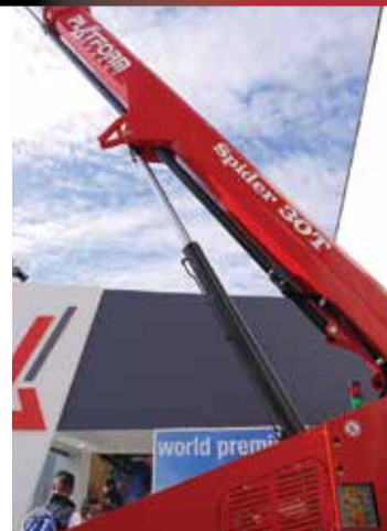
The new 30 metre 30T.

The 30T includes high clearance outriggers with variable positioning, including asymmetric set up, automatic levelling and stowage. Maximum outreach is 14.2 metres with automatic working envelope monitoring, a maximum platform capacity of 230kg and the quick detach basket is standard. Managing and sales director Carlo Molesini said that more new models are planned for next year.