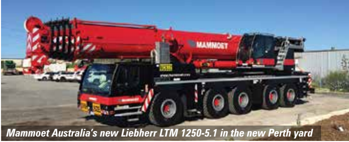
Mammoet Australia's new Liebherr LTM 1250-5.1 in the new Perth yard