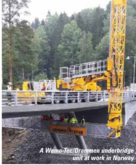
A Wemo-Tec/Drammen underbridge unit at work in Norway.

The move will build on Wemo-Tec's existing partnership with Danish underbridge specialist Frantz Schrum for Denmark and Sweden. The three companies plan to work together in the Nordic region to provide customers with a full underbridge and tunnel access service for both inspection and maintenance work.