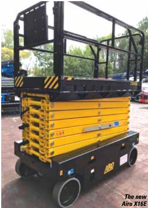
The new Airo X16E

Working height is just under 16 metres, while platform capacity is 250kg on both the main deck and the 1.5 metre deck extension. The new lift is driveable at full height and is rated for indoor use only. Shipments should start in November.