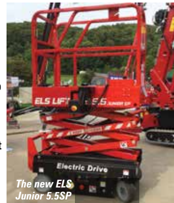
The new ELS Junior 5.5SP

The RT18L has a working height of 17.95 metres, an extended platform length of 7.38 metres with 690kg capacity on the main deck and 227kg on the extensions. Overall weight is 7,639kg. The lift has levelling jacks and can drive at platform height of up to 9.14 metres.