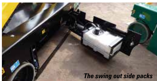
The swing out side packs