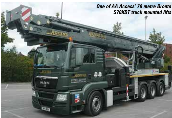
One of AA Access' 70 metre Bronto S70XDT truck mounted lifts