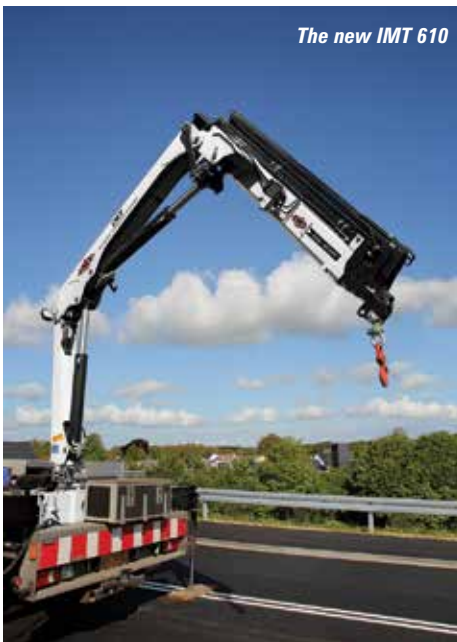
The new IMT 610

The new models are essentially US versions of the HMF range topped by the 910K, and replace the IMT 5/33, 6/39 and 7/48 cranes. They offer increased load moments ranging from six to nine tonnes with hydraulic boom reach of up to 14 metres. The new cranes will also feature the HMF Electronic Vehicle Stability (EVS) system, which monitors the tilt angle of the truck's chassis inputting the tilt angles, chassis flex and outrigger pressures into the fully integrated Rated Capacity Limiter (RCL) to maximise lifting capacities, while enhancing machine safety and improving speed and efficiency.