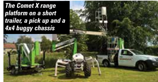
The Comet X range platform on a short trailer, a pick up and a 4x4 buggy chassis

Rytec Industrial Equipment, an agricultural, forestry and horticultural equipment distributor that dates back to 1992.