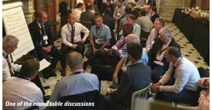
One of the round table discussions