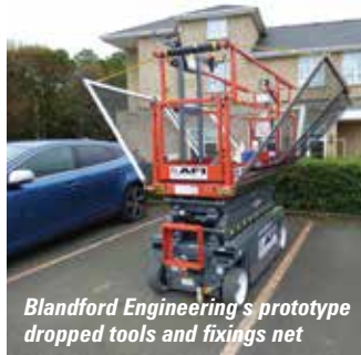
Blandford Engineering's prototype dropped tools and fixings net