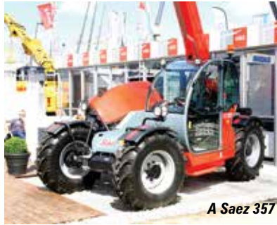
A Saez 357

Based in Neunkirchen, north west Germany, Equipment Service also handles CMC spider lifts and truck mounted platforms. The Saez telehandler range includes three models with capacities of 3,000kg and 4,000kg and lift heights to 17 metres. The company dipped its toe in the telehandler market in 2007 but ran into financial difficulties following the collapse of the Spanish construction market and is now looking to increase its modest telehandler sales.