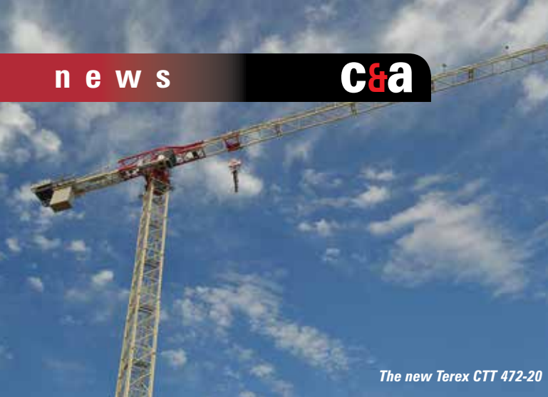
The new Terex CTT 472-20