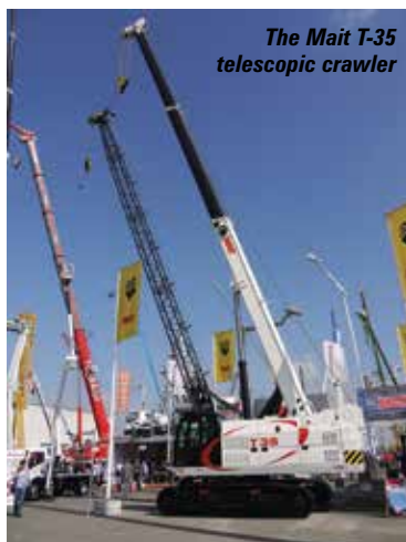
The Mait T-35 telescopic crawler