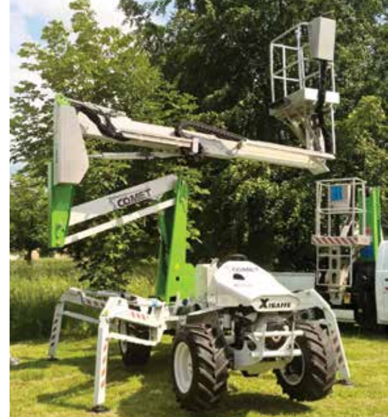
Another interesting new platform is the 33ft platform height/12 metre working height, Comet Xiraffe

mostly boom lifts. One of the larger players is Platform Basket which the 1200SJPs to Norwegian rental recently unveiled an all new 40ft company Naboen which says it is articulated self-propelled road rail experiencing increased demand for boom lift, the RR14 EVO 3. With up to 14 metres of working height JLG says that for this size of machine and is aimed at the maintenance it prefers to focus on hybrid solutions of electrical catenaries and lighting however it does agree that the longsystems along rail tracks. Features term future is all electric equipment. include four wheel drive and steer, with a maximum travel speed on