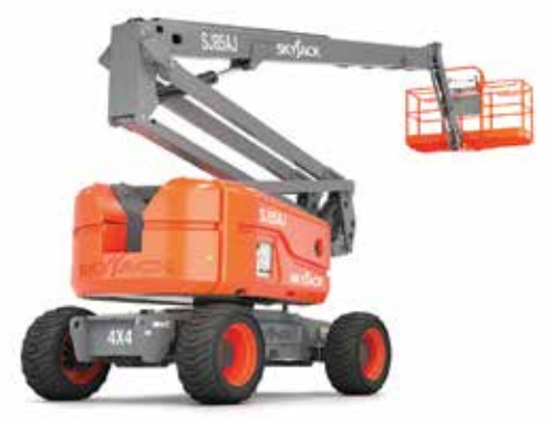
Largest of Skyjack's articulated booms the SJ85 AJ has a 27.9 metre working height and just over 17 metres of outreach.