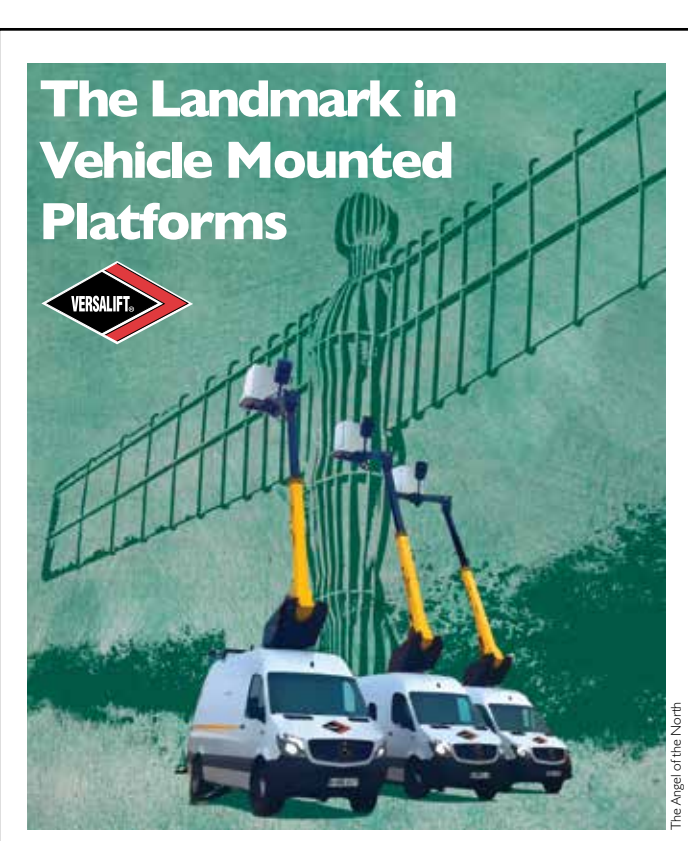
Intelligent Control - Up to 9m of perfectly controlled outreach with Versalift's Load Moment Control