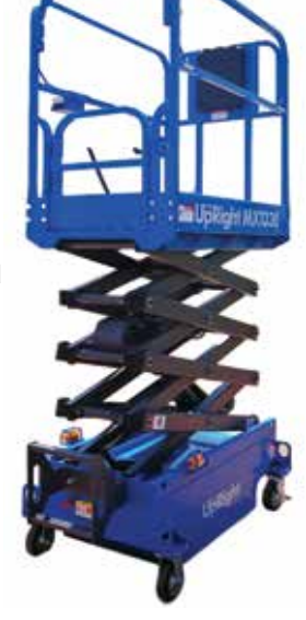
The UpRight MX1330 push around scissor lift

be home to a technical help desk. A further technical support team for the powered access products will be based at the company's Dublin headquarters where it has moved into a new 10,000 square metre manufacturing facility. The initial focus will be on European and Asian markets selling to small and medium sized rental companies both direct and through dealers.