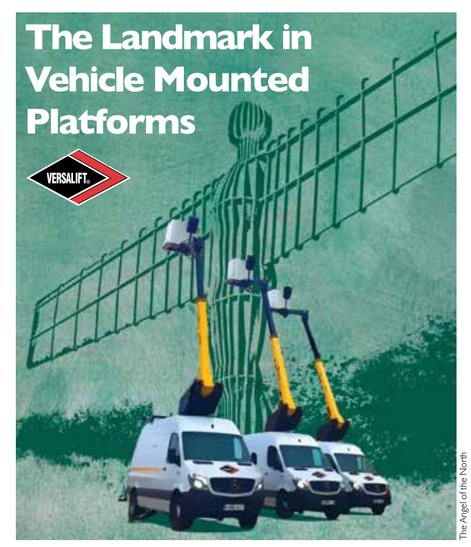
Intelligent Control - Up to 9m of perfectly controlled outreach with Versalift's Load Moment Control