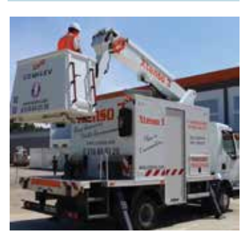
Klubb buys truck mounted lift manufacturer Comilev out of administration.

JCB enters the powered access market with a range of slab electric scissor lifts.