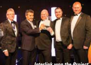
Interlink won the Project of the year Award

The NASC 2017 Scaffolding Project of the Year Award was won by Interlink Scaffolding for its work on the New Wear Crossing in Sunderland, where it installed multiple scaffolds on the central support tower prior to it being erected. There were 12 entries in all, with just three points separating the first three. In the view of the judges, Interlink's 'Interface with the client' was one of the key criteria in its success, they were also impressed by the degree of offsite preparation prior to erection of the bridge structure, complete with scaffolding.