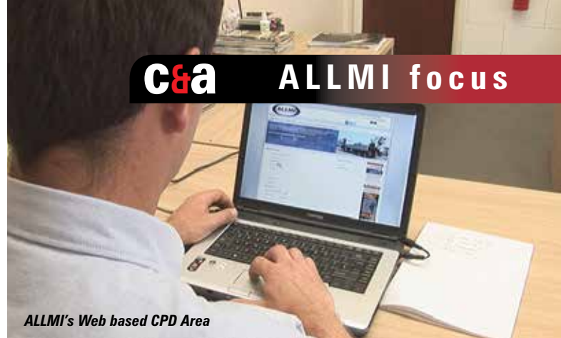
ALLMI's Web based CPD Area

presence and credibility is stronger than ever. However, as demand grows it is essential that the highest standards are maintained throughout our Instructor network and we have numerous mechanisms in place to achieve that, including comprehensive instructor training, quality training aids and material, ongoing technical support, rigorous auditing and a Continuing Professional