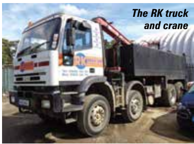
The R K truck and crane