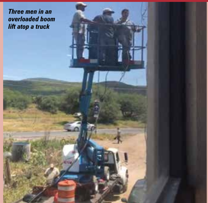
Three men in an overloaded boom lift atop a truck

Spotted by a reader, a group of men misusing a boom lift. To begin with, they did not bother to unload the platform, secondly there are three of them in the basket, including one who is a little hefty - certainly more than the 'average' 80kg, so they are almost certainly exceeding the Genie Z-45's 227kg maximum platform capacity. Thirdly they are installing an overhead cable, alongside what looks like power lines, and finally they are not wearing harnesses or lanyards.