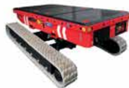
Tracked Leveller Trolley