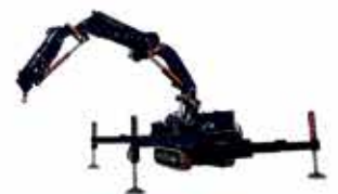
TMC 525 Articulated Crawler Crane