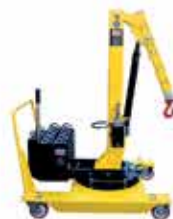
Slewboy 500 Lifting Solutions