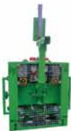
GRC Lifter Stone Lifter