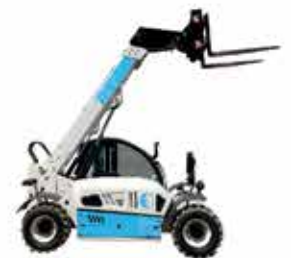
Eco Telehandler 2.6t Pick & Carry Crane