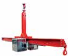
Libro 12000 Overhang Beam