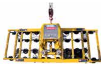
Hydraulica 6000 Glass Vacuum Lifter