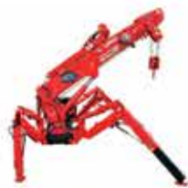
UNIC URW-295-3 Mini Spider Crane