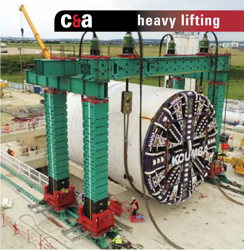
French heavy lift company Scales SAS has used an Enerpac JS-250 Jack-up gantry system to lift and lower Koumba - a 8.9m diameter, 11.4m long tunnel boring machine weighing 880 tonnes - in the latest phase of the Paris Metro extension project.

Overload testing for the SCJ-60 has now been completed using four Cube Jacks connected together to provide simultaneous lifting and lowering, lifting a 226.5 tonne test load up to a height of two metres. The Cube Jacks were also subjected