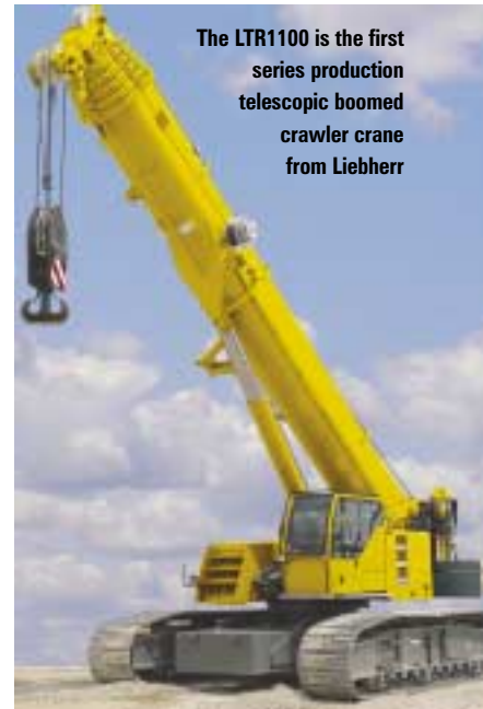
The LTR1100 is the first series production telescopic boomed crawler crane from Liebherr

Depending on how it is specified, the LR1100 is likely to be priced close to that of the LTM1100 All Terrain and LR1100 lattice crawler.