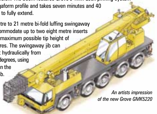
An artists impression of the new Grove GMK5220

A 12 metre to 21 metre bi-fold luffing swingaway can accommodate up to two eight metre inserts giving a maximum possible tip height of 105 metres. The swingaway jib can be offset hydraulically from 0 to 40 degrees, using controls in the crane cab.