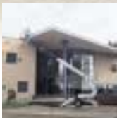
DINO T-MODELS DINO 105T, 125T, 135T, 150T, 180T, 230T