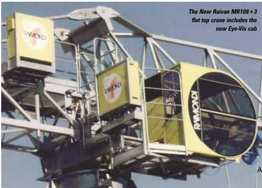
The New Raivan MR108+3 flat top crane includes the new Eye-Vis cab

The MR108 incorporates the new Eye-Vis cab shown by Vanson at this years SED, and features the "Soft start" control system with smooth motor control proportionality for precise operation and a reduction of shocks to components and structure. The pistol type joystick controls feature a sensitive dead man feature, aiding comfort for operators on longer shifts.