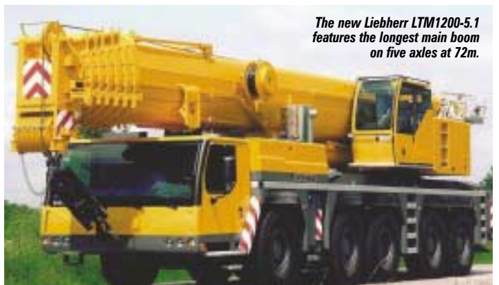
The new Liebherr LTM1200-5.1 features the longest main boom on five axles at 72m.

The carrier also features all wheel, speed sensitive, steering with a choice of six modes, including Crab steering which does not require the centre axle to be raised.