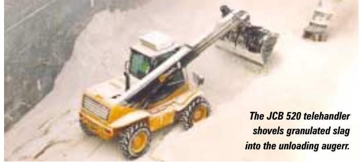
The JCB 520 telehandler shovels granulated slag into the unloading auger.