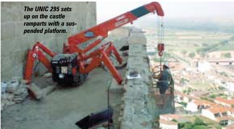
The UNIC 295 sets up on the castle ramparts with a suspended platform.