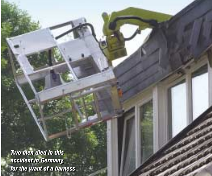
Two men died in this accident in Germany, for the want of a harness