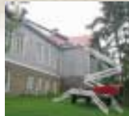
DINO RXT-MODELS DINO 205RXT, 240RXT