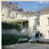
DINO XT-MODELS DINO 160XT, 180XT, 210XT, 260XT