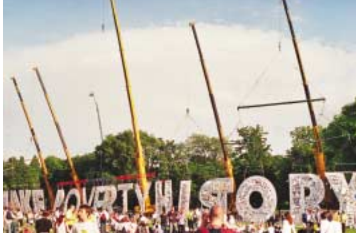
Five Hewden cranes and 130 metres of spreaders raise the words at the G8 rally.