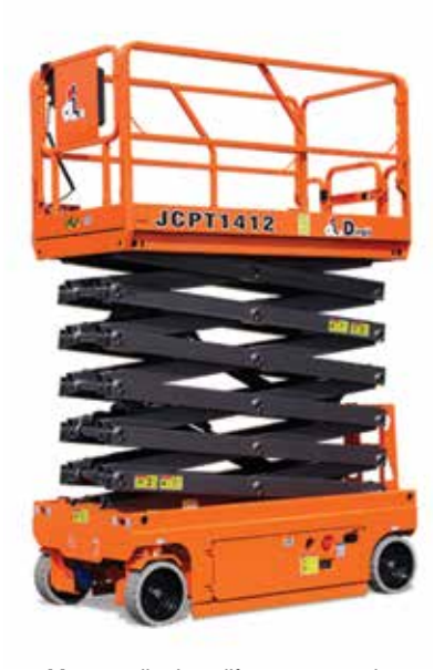
Many small scissor lifts are now made

However, in many markets the downside is that rental rates are lower now than they were back then! Low rates should result in more widespread use and greater market penetration, longer-term rental agreements and contractors renting more machines to carry out the same amount of work as each skilled tradesman gets a dedicated machine. That's the theory.