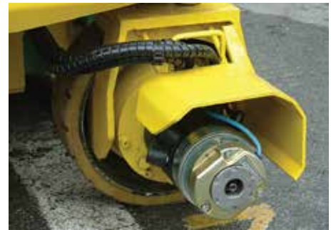
The Iteco IT7380 was the first to follow JLG with direct electric drive.

all of its new platforms with lithium ion battery packs. It chose JCB as its slab scissor lift supplier, which having struggled to get a foothold in the access market, was probably more than happy to install lithium batteries for a 420 unit order. However, its scissor lifts have traditional hydraulic wheel drive motors, so while the lithium battery pack may well offer a longer life between recharges, it is entirely likely a machine with direct electric drive and regular lead acid batteries will outperform them? Now if you were to add the lithium battery pack to a direct electric drive.... you might have something really spectacular.