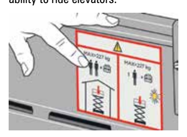
Many slab scissor lifts will now have a different rating when working outside.

and well as floor loadings and the ability to ride elevators.