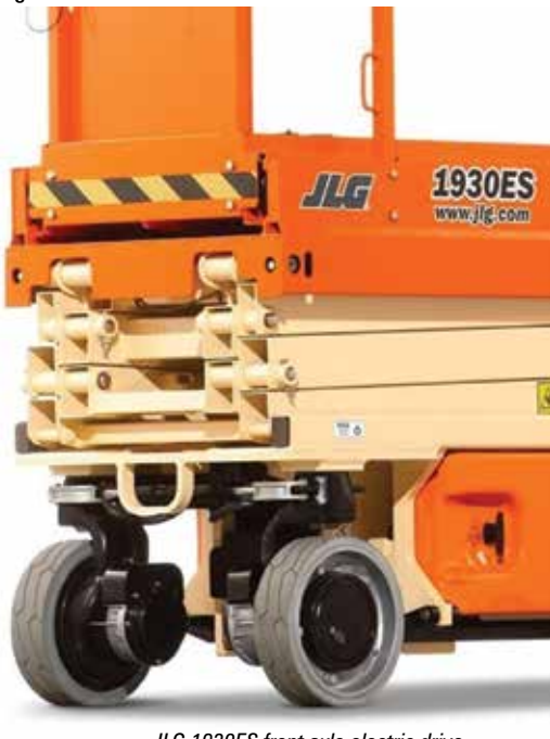
JLG 1930ES front axle electric drive.

While JLG stepped up to the problem relatively quickly switching the covers to pressed steel and adding more robust wheels. The negativity at launch overshadowed the major advantages that their direct electric drive offered, especially for long shift or long drive applications. Some of the smarter rental companies not only added them to their fleets but ran them alongside regular hydraulic drive models, helping achieve decent rental rate premiums as end users became converts. Better still the slow take up, meant that customers were tied into the few rental companies that ran them at