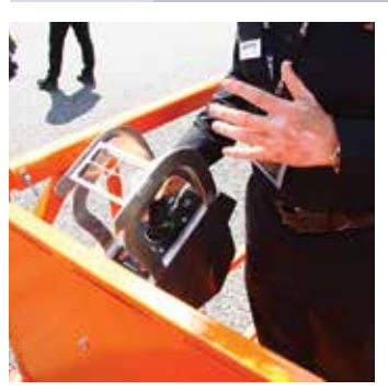
Snorkel Guard secondary guarding system covers the lift control box which when pressed stops the machine rising.