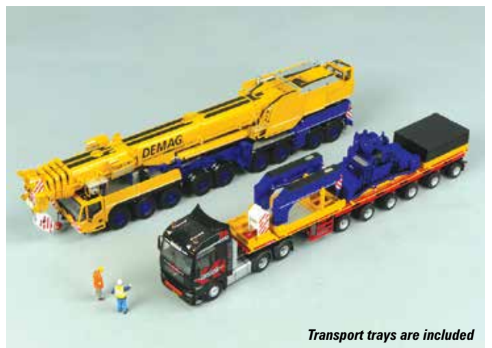
Transport trays are included