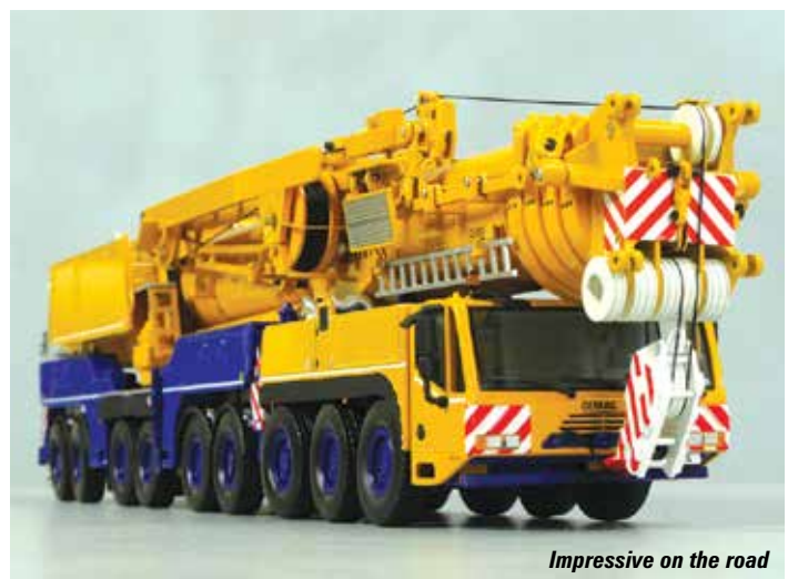
Impressive on the road