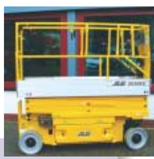
The JLG 2030 ES was painted in bright yellow customer colours

They did not appreciate the mix of aluminium and steel between platform and scissor arms, they thought the guardrails were fussy and lacked rigidity. Service access was also considered to be only average with components spread out over the machine.