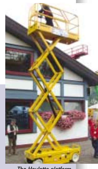
The Haulotte platform height is checked.