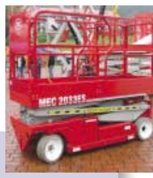
The MEC had the lowest platform height

The new MEC company purchased the parts inventory and designs from Mayville three years ago, since then MEC international has re-engineered the designs, reducing the overall dimensions, enhancing the performance and incorporating high grade simple components. This unit was a surprise to the judges, who were impressed with its performance. The judges liked the low entry level, but disliked the placing of the control box cable which due its entry point was all over the deck. The turning circle and lift/drive speeds were excellent and the approach to serviceabilty and access were liked especially the lift off hinged covers, they didn't like the oil filter location which they considered vulnerable. The unit was one of the few that did not feature diagnostics or sophisticated electronics.