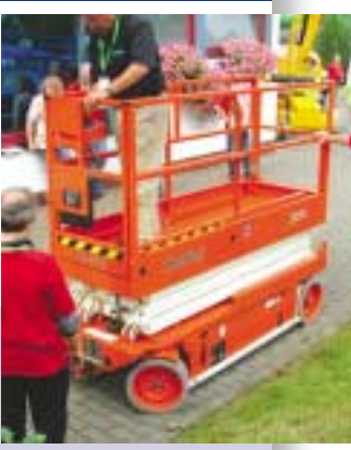
The Snorkel was a reluctant entry but performed well

Snorkel was reluctant to enter the S2033, it is due for replacement next year, with a model that incorporates the latest features that are already built into the 19 and 26 models. The S2033 while not using the latest technology does have a following among Snorkel buyers who like the simple easy to repair design. In spite of its age it offered one of the lowest entry heights and fastest lift speeds in the check. The controls are two speed rather than full the proportional as used on all of the other units we tested and as you might expect was nowhere near as smooth. The turning circle was the second largest of the group and the unit tested was longer that the specification claimed at over 2.5 metres but the machine performed very well, particularly given Snorkels reticence.